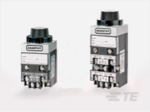
TE Part # 2-1423159-6 7012PD=RLY,STD,ON,2P,125VDC,50