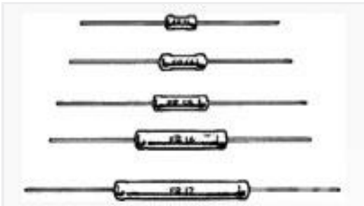
TE Part #1-1623750-3 ER58 20K 5% AMMO