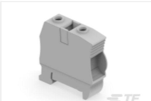
TE Part #1SNK516010R0000 ZS35