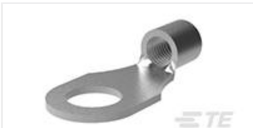
TE Part #321828 TERMINAL,SOLIS R 14-12 10

Product Drawings 7012ACL=RLY,STD,ON,2P,120VAC,1