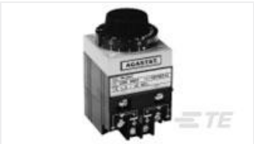
TE Part #1423162-2 7022AB=RLY,STD,OFF,2P,120VAC,5