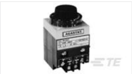
TE Part #3-1423157-1 7012BD=RLY,STD,ON,2P,240VAC,50