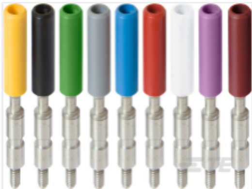
TE Part #1SNA206681R0200 AJS9-GN