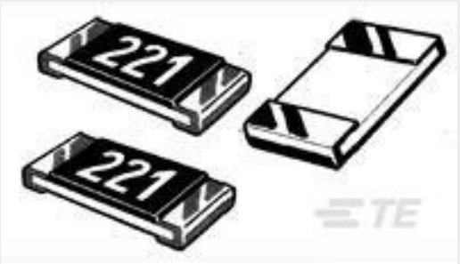
TE Part #9-2176070-7 3521 100K 1% 2W