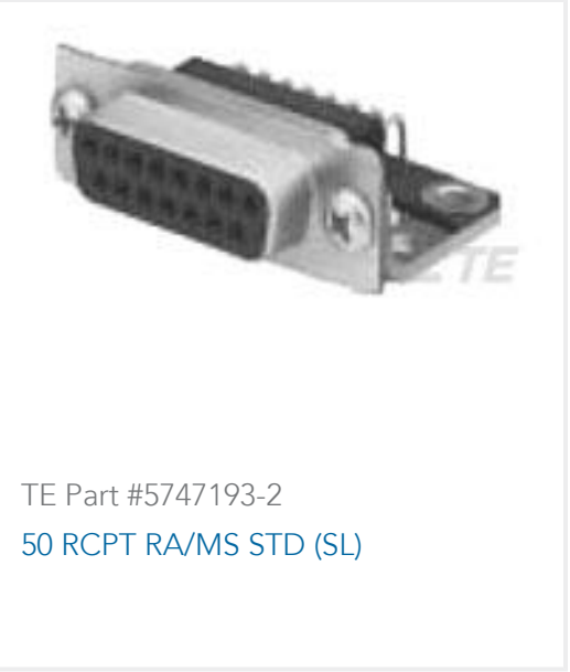
TE Part #5747193-2 50 RCPT RA/MS STD (SL)