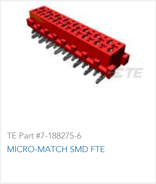
TE Part #7-188275-6 MICRO-MATCH SMD FTE