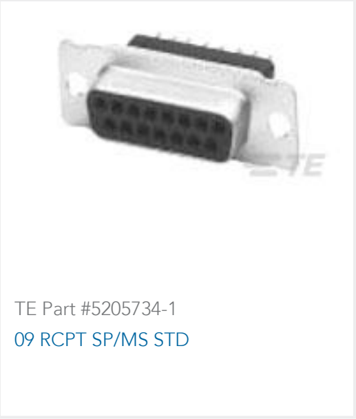
TE Part #5205734-1 09 RCPT SP/MS STD