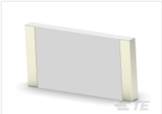
TE Part #3-2176246-8 CRGS2512 5% 1K2