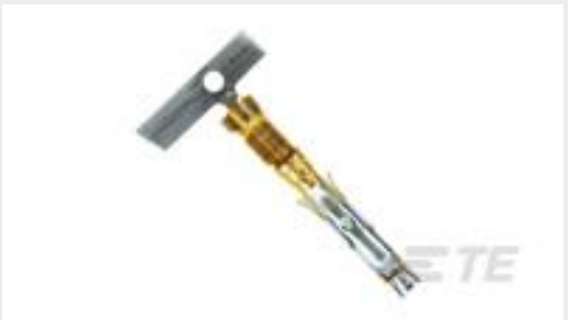
TE Part #1658670-1 PIN CONTACT,22 DF,STRIP,22-28