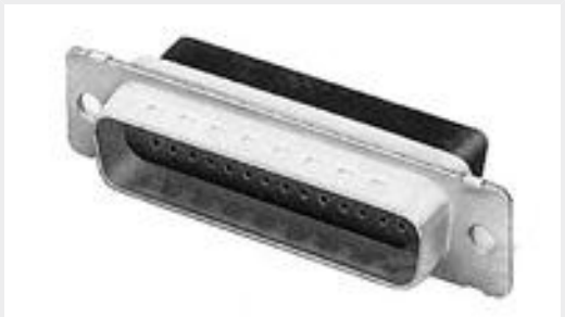
TE Part #748364-1 15 HD22 CRIMP SNAP PLUG