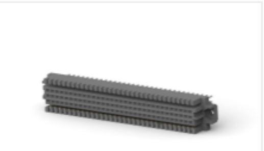
TE Part #5148452-5 ASSY,RECPT,ENH.TYPE C,EUROCARD,L-FREE,5