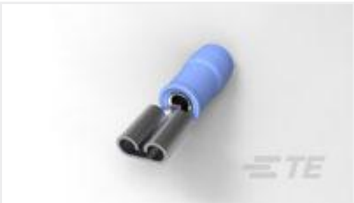
TE Part #640915-2 RECEPT,PIDG FASTON 16-14 205