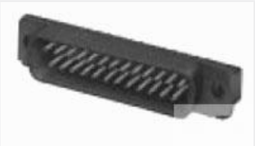
TE Part #5745074-4 HD-20 PLUG 37P VERT FFSCRLK