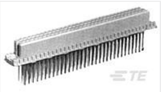
TE Part #5148059-5 ASSY,RECEPTACLE,EUROCARD,TYPE C,LEAD-FREE