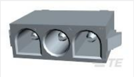
TE Part #350790-3 03P UMNL PIN HDR ASSY 94VO LF