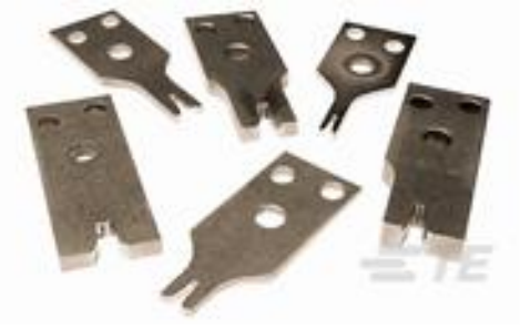
TE Part #7-657555-9 DRAHTCRIMPER

Instruction Sheets Instruction Sheet (U.S.) English