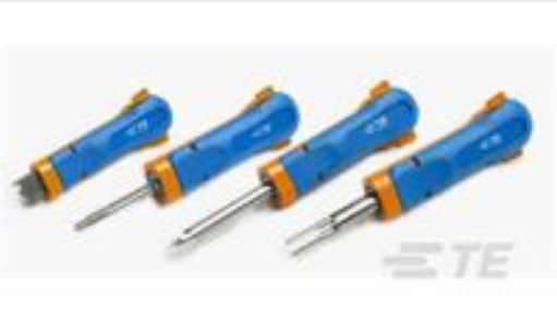
TE Part #1579007-8 EXTRACTION TOOL