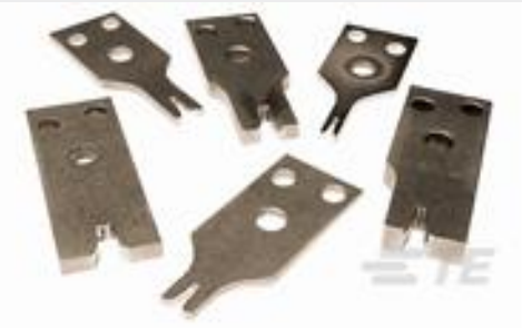
TE Part #1-456407-3 CRIMPER, WIRE .100 F