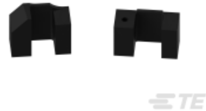
TE Part #1424350-1 HOLDER, PIN, WIRED