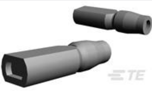
TE Part #2-170823-0 250 FASTON SLEEVE, REC., TRANSPARENT, NAT