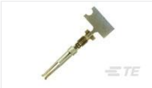
TE Part #745253-6 20 DF SOCKET CONT L.P.