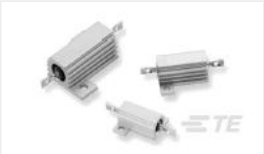
TE Part #1879071-3 THS50 R05 5%