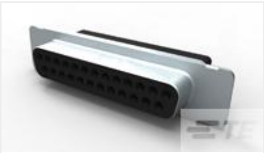
TE Part #5205207-1 HD RECPT ASSY SIZE 3