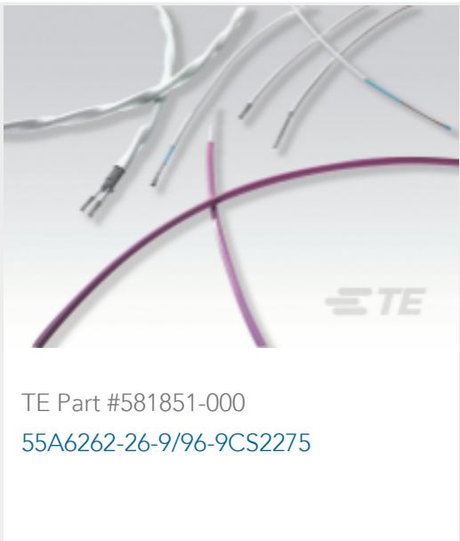
TE Part #581851-000 55A6262-26-9/96-9CS2275