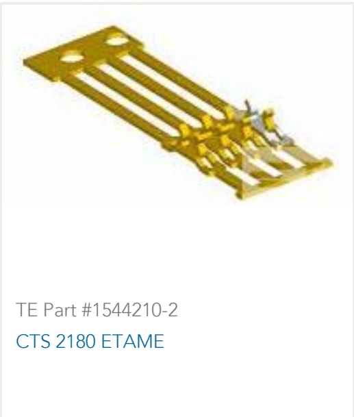
TE Part #1544210-2 CTS 2180 ETAME