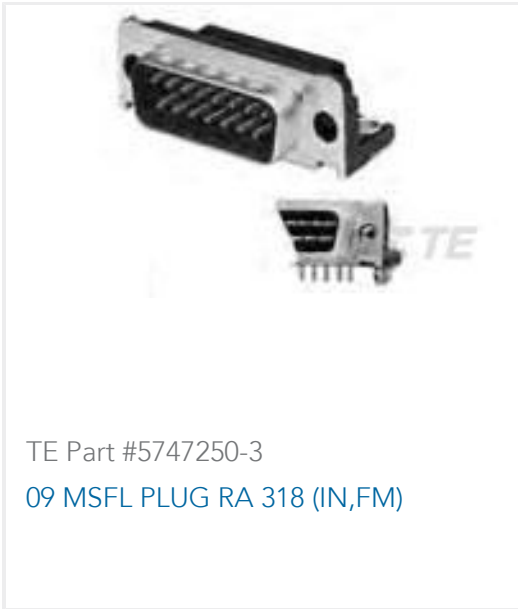
TE Part #5747250-3 09 MSFL PLUG RA 318 (IN,FM)