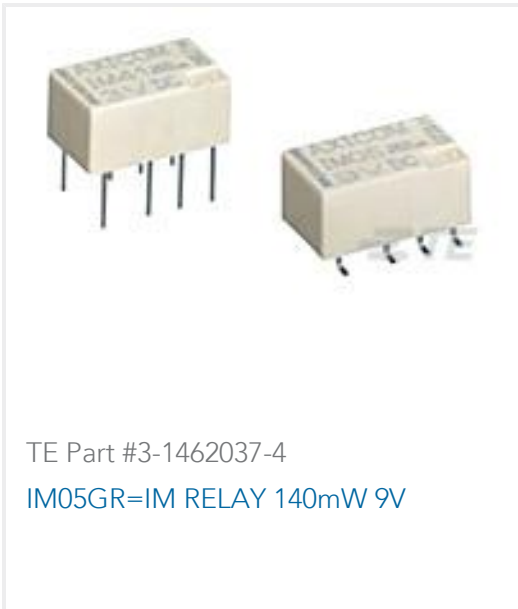
TE Part #3-1462037-4 IM05GR=IM RELAY 140mW 9V