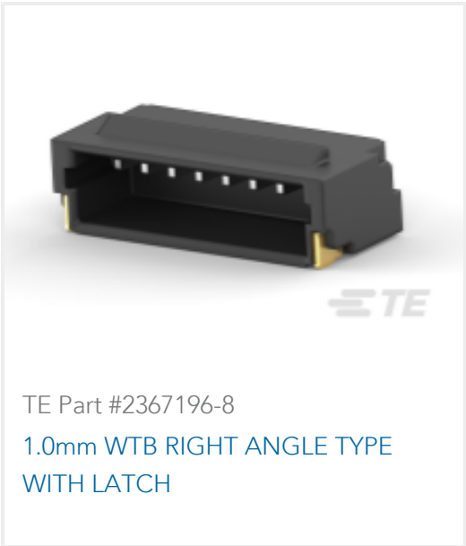
TE Part #2367196-8 1.0mm WTB RIGHT ANGLE TYPE WITH LATCH