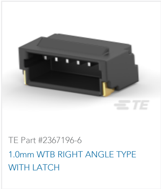
TE Part #2367196-6 1.0mm WTB RIGHT ANGLE TYPE WITH LATCH