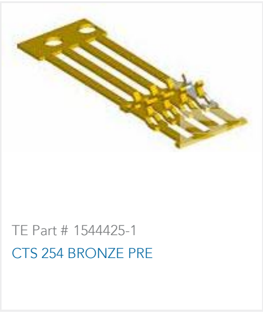
TE Part # 1544425-1 CTS 254 BRONZE PRE