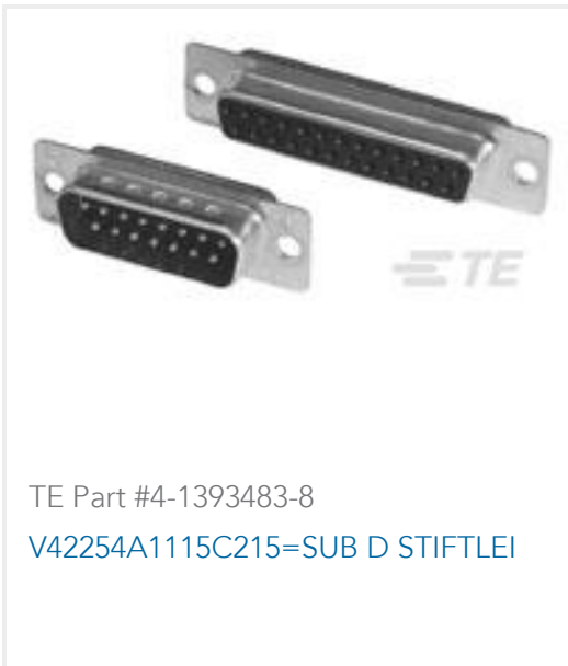
TE Part #4-1393483-8 V42254A1115C215=SUB D STIFTLI

Product Drawings CONTACT A SOUDER English