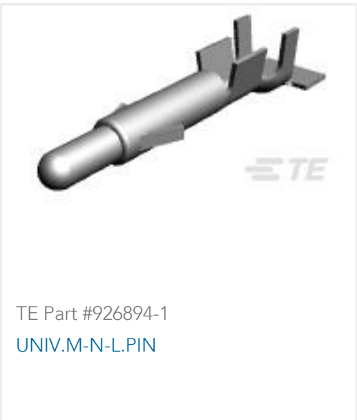
TE Part #926894-1 UNIV.M-N-L.PIN