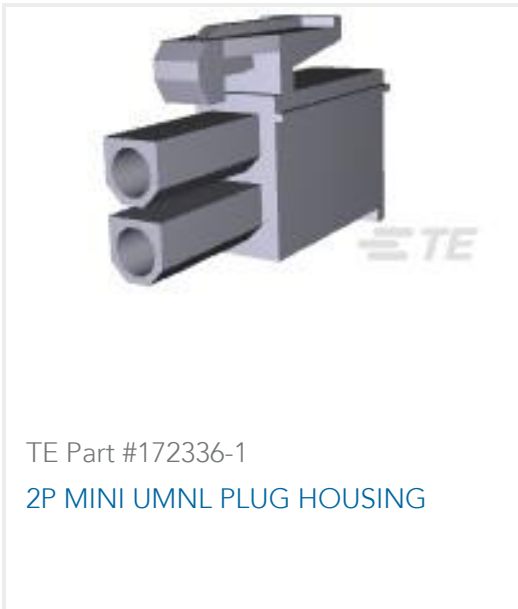
TE Part #172336-1 2P MINI UMNL PLUG HOUSING