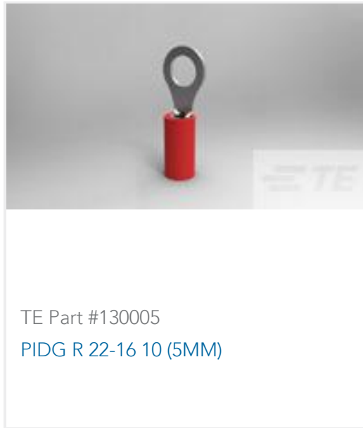
TE Part #130005 PIDG R 22-16 10 (5MM)