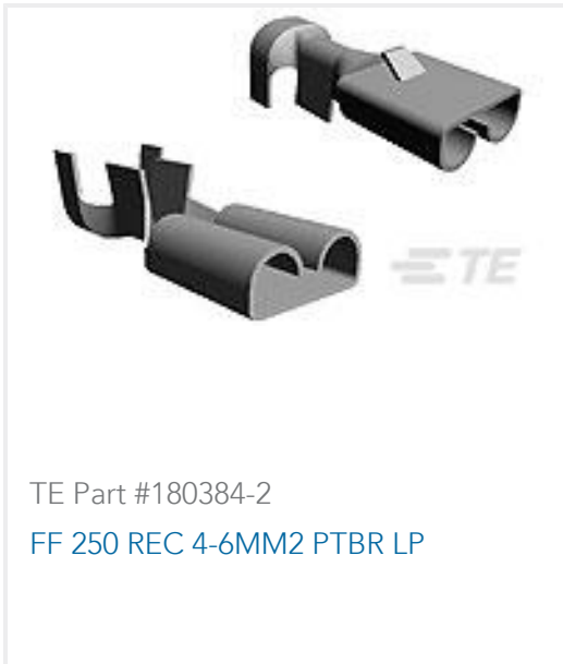
TE Part #180384-2 FF 250 REC 4-6MM2 PTBR LP