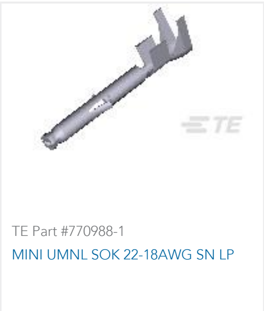
TE Part #770988-1 MINI UMNL SOK 22-18AWG SN LP