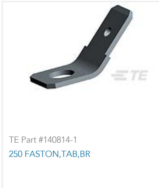
TE Part #140814-1 250 FASTON,TAB,BR