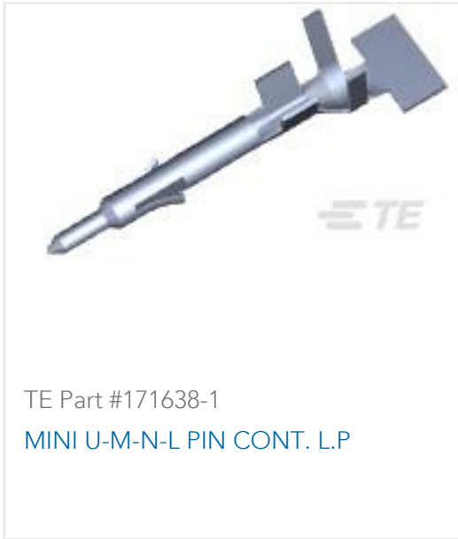
TE Part #171638-1 MINI U-M-N-L PIN CONT. L.P