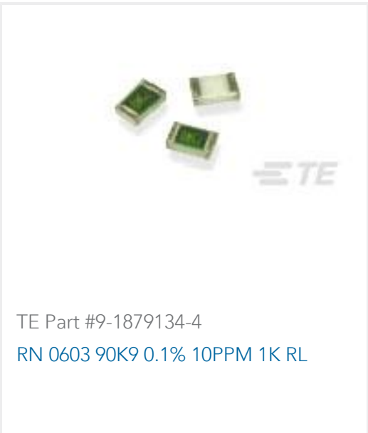
TE Part #9-1879134-4 RN 0603 90K9 0.1% 10PPM 1K RL