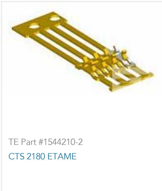
TE Part #1544210-2 CTS 2180 ETAME