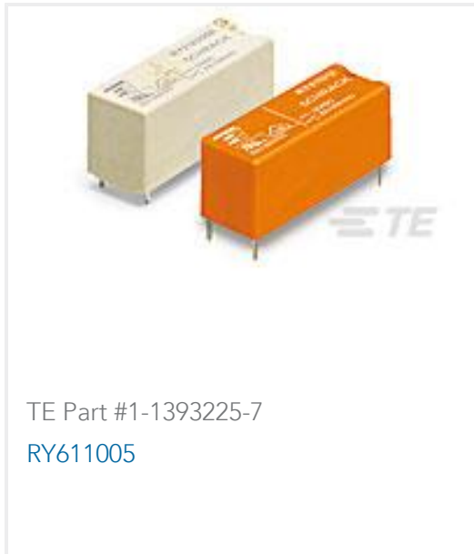
TE Part #1-1393225-7 RY611005