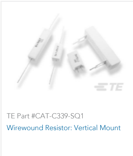
TE Part #CAT-C339-SQ1 Wirewound Resistor: Vertical Mount