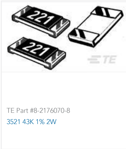
TE Part #8-2176070-8 3521 43K 1% 2W