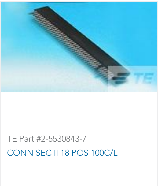
TE Part #2-5530843-7 CONN SEC II 18 POS 100C/L

Product Drawings CONTACT A SOUDER English