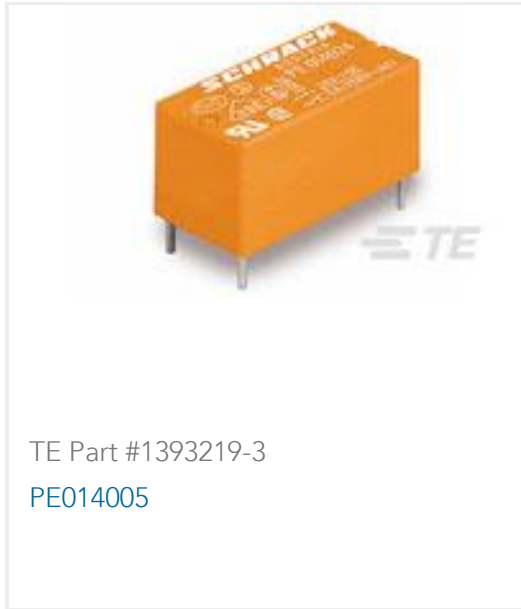
TE Part #1393219-3 PE014005