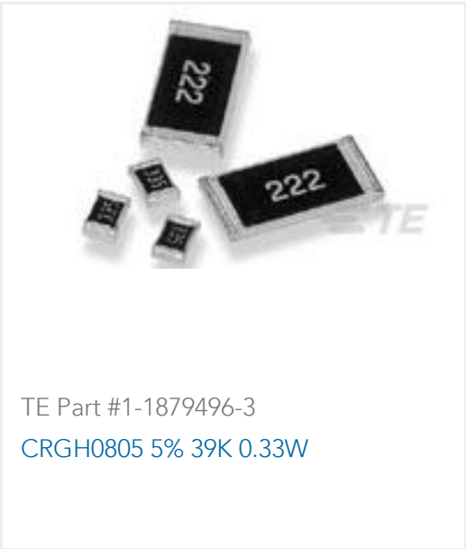
TE Part #1-1879496-3 CRGH0805 5% 39K 0.33W