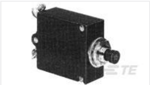
TE Part #7-1393246-2 W23-X1A1G-35=W23/W31