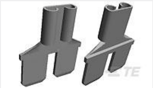
TE Part #61765-2 FASTON ADAPTER .250 REC TPBR