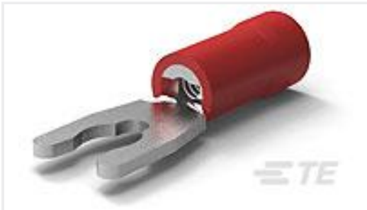
TE Part #52949-1 PG SPR SPD 22-16COMM 22-18MIL6