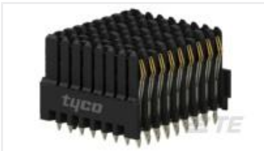
TE Part #1410186-1 MULTIGIG RT T2 .8" BP H-LFT