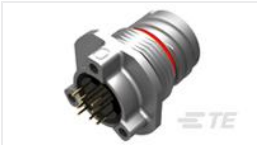
TE Part #2102351-1 CeeLok FAS-T, Receptacle Kit, PCB, Ni