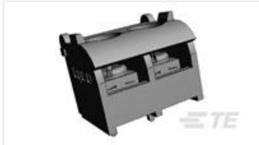
TE Part #1546927-2 2P .325 TRI-BARRIER W/COVER DEG