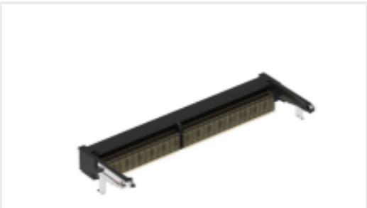
TE Part #2309413-1 DDR4 SODIMM 260P 9.2H STD