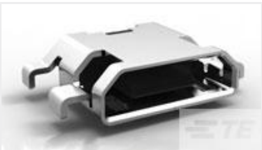
TE Part #2134441-2 MICRO USB, TYPE B, MIDMOUNT, REVERSE