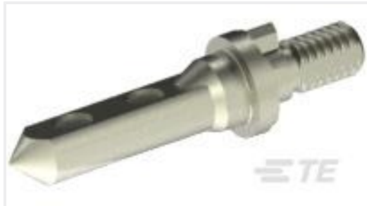
TE Part #1-1469491-2 MULTIGIG RT GUIDEPIN, 9MM 2.60