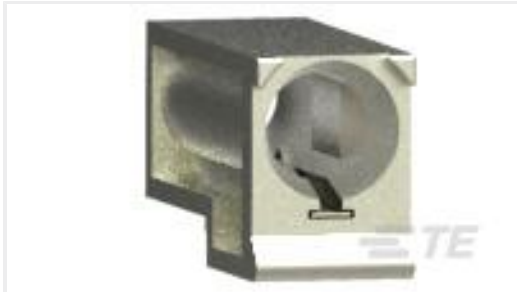
TE Part #1-1469492-7 MULTIGIG RT 9MM GUIDE/ESD 270 DEG