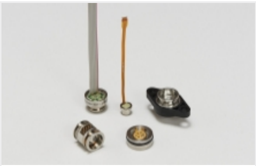
Media Isolated Pressure Sensors(75)