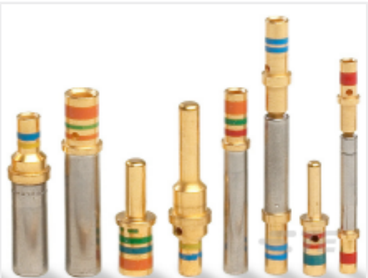
TE Part #ZPF000000000000568 020-0511-12