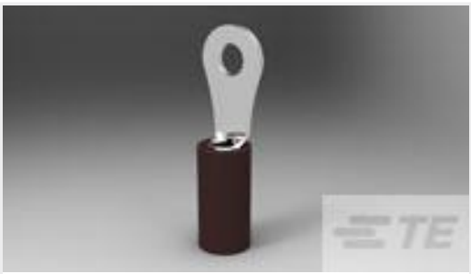
TE Part #1577620-1 TERMINAL RT PIDG PEEK STRATO 24-22 AWG