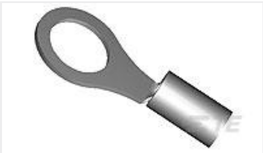
TE Part #323169 STRATO-THERM, R, HR, 6, #10, NIPL