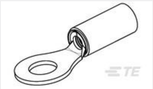
TE Part #1577648-1 TERMINAL RT PIDG PEEK STRATO 10 AWG