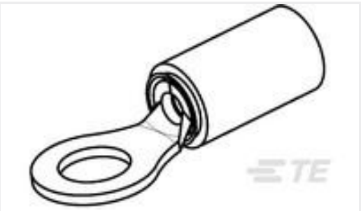
TE Part #1577640-1 TERMINAL RT PIDG PEEK STRATO 14-12 AWG