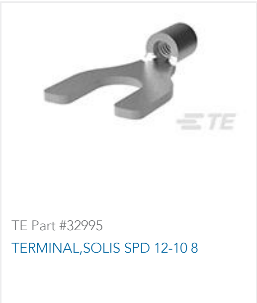
TE Part #32995 TERMINAL,SOLIS SPD 12-10 8