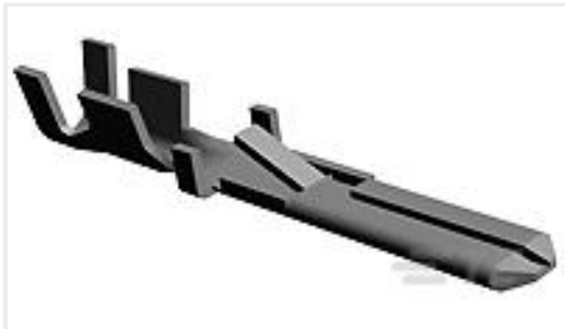
TE Part #928781-5 FF 110 TAB 1.0-2.5 MM2 PTP CUSN4