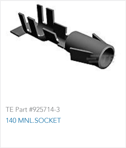
TE Part #925714-3 140 MNL.SOCKET