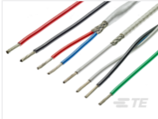
TE Part #2831433006 44A0111-20-2L