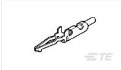
TE Part #172782-7 LOW PROFILE MINI AMP-IN