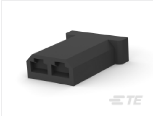
TE Part #925014-1 FF 110 HOUSING RECEPTACLE PA 6.6 BLACK