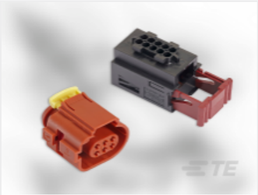
TE Part #CAT-T4827-CH8172 Timer Connector Housing