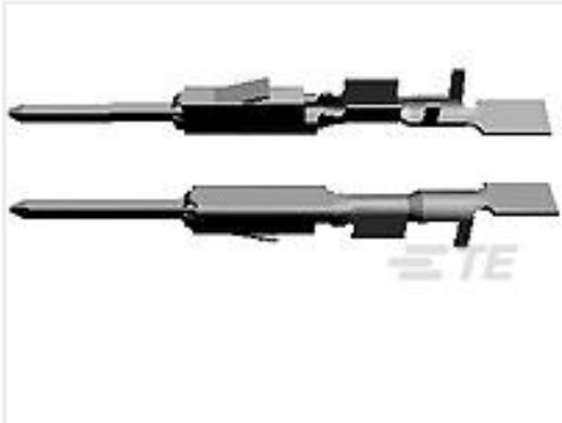
TE Part #6-928918-2 MQS0,63 Au tab LL unseal. 0,2-0,35