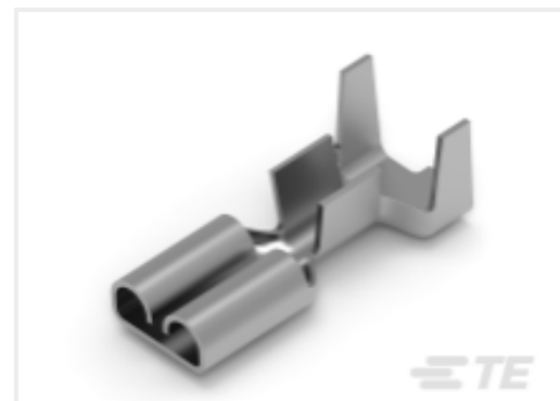
TE Part # 63467-1 FF 250 REC 14-10AWG TPBR