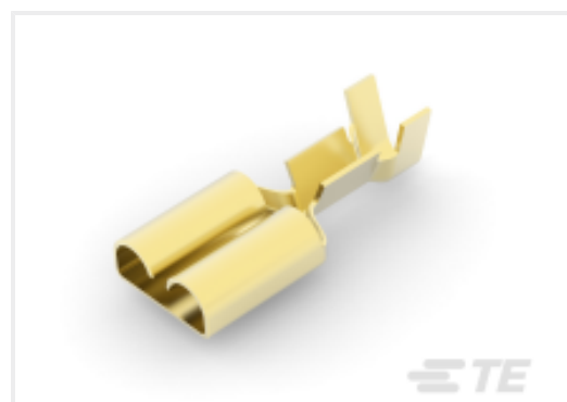
TE Part # 626094-1 TERMINAL, .250 FASTIN-ON REC