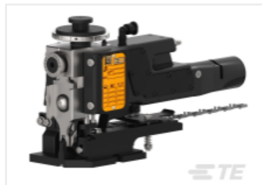
TE Part # 2150193-2 OCEAN_2.0_Applicator-E-080F110OV-REA