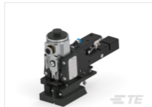
TE Part # 2150193-1 OCEAN_2.0_Applicator-E-080F110OV-REM