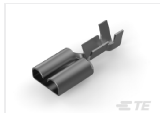
TE Part # 626094-2 FF .250 REC 0.5 /1.0 MM2 0.32X19.3 TPBR