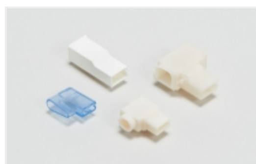
Crimp Terminal Housings(195)