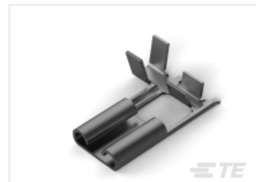
TE Part # 160871-6 FF 250 REC TERMINAL FLAG 20-17 TPBR