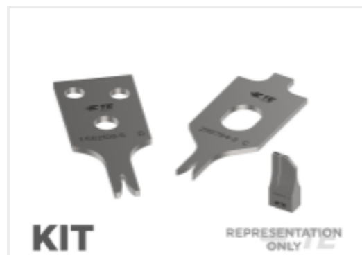
TE Part # 7-2150193-7 OCEAN_2.0_SPARE_PART_KIT-080F110OV