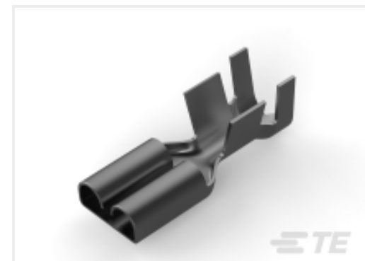
TE Part # 626328-2 FF 250 RECEPTACLE 4.0-6.0 MM2 TPBR