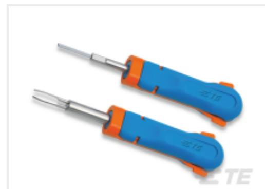
TE Part # 4-1579007-3 EXTRACTION TOOL KIT