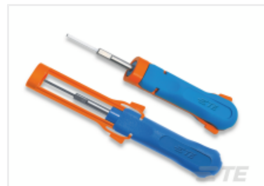
TE Part # 1-1579007-4 EXTRACTION TOOL