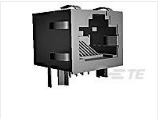
TE Part #1-406541-5 MJ,INV,1X1,0PNL G.,100"ST,SN