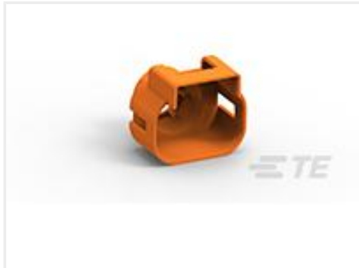
TE Part #2103013-1 CABLE SEAL RETAINER, SIZE 1, HVA280