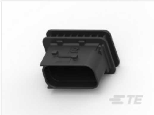
TE Part #2112302-1 PROTECTION CAP, FOR REC.HSG GROUP D