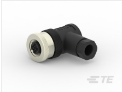
TE Part #T4112001051-000 M12,FEMALE,RA,A CODE,5P,PG7, GOLD