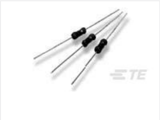
TE Part #1-1879354-3 RR03 5% 1R0 AMMO