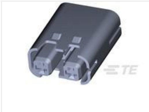
TE Part #1587985-1 INNER HSG SUBASSY, HVA280-2PHM