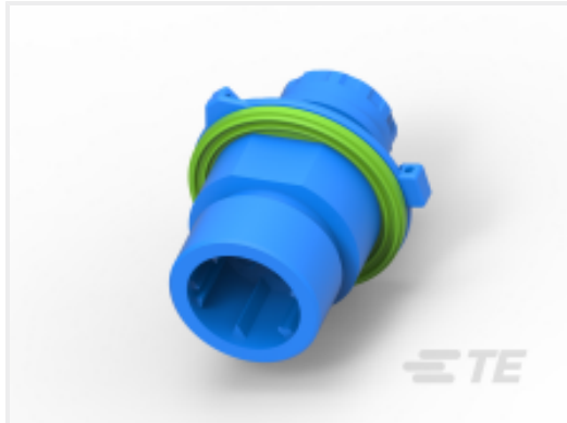
TE Part #CAT-C4962-CH8172 Circular DIN Housings