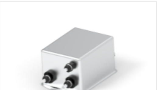
TE Part #802436-SF FN2030-30-08