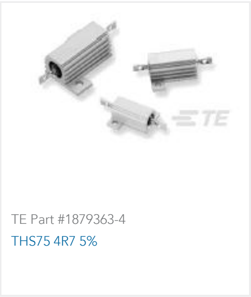
TE Part #1879363-4 THS75 4R7 5%