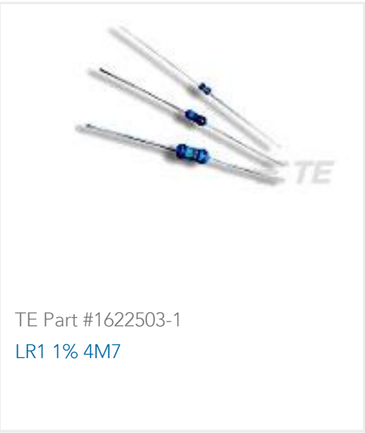
TE Part #1622503-1 LR1 1% 4M7