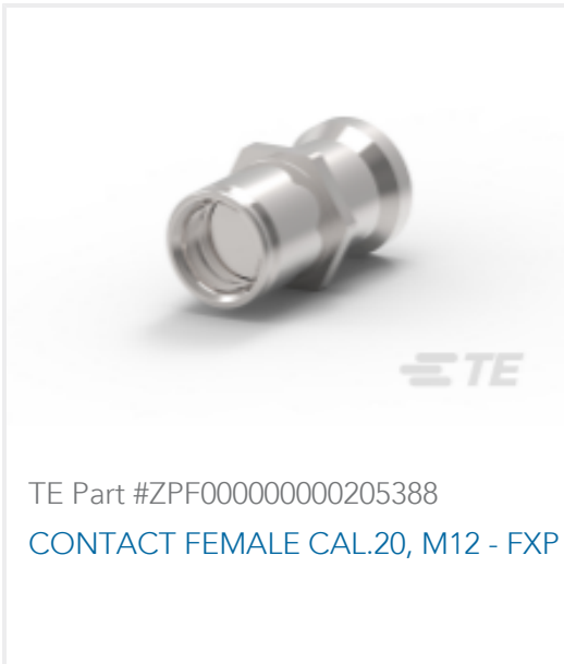
TE Part #ZPF000000000205388 CONTACT FEMALE CAL.20, M12 - FXP