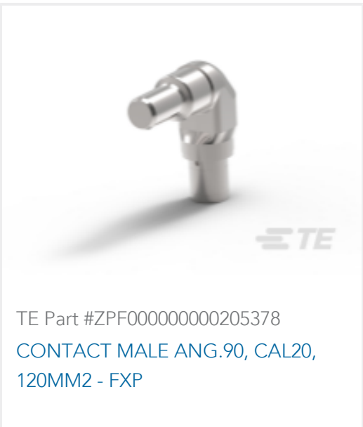
TE Part #ZPF000000000205378 CONTACT MALE ANG.90, CAL20, 120MM2 - FXP