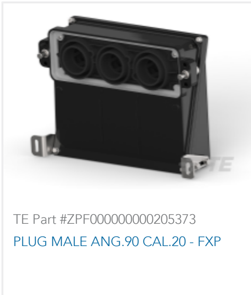
TE Part #ZPF000000000205373 PLUG MALE ANG.90 CAL.20 - FXP