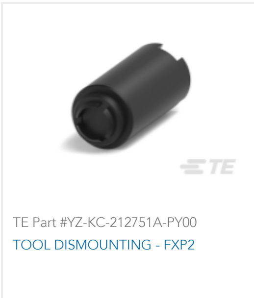
TE Part #YZ-KC-212751A-PY00 TOOL DISMOUNTING - FXP2