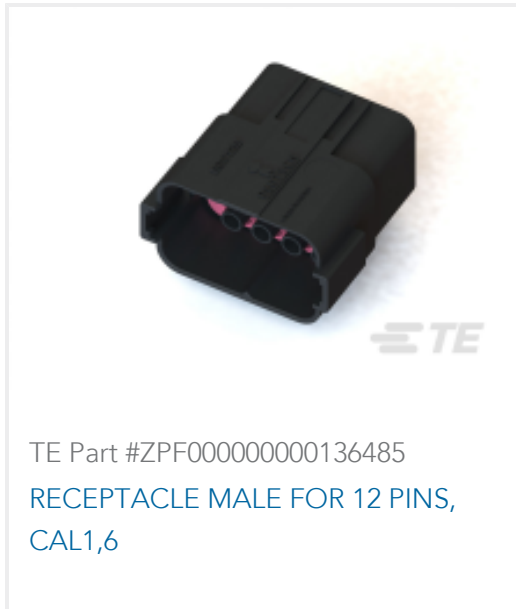
TE Part #ZPF000000000136485 RECEPTACLE MALE FOR 12 PINS, CAL1,6