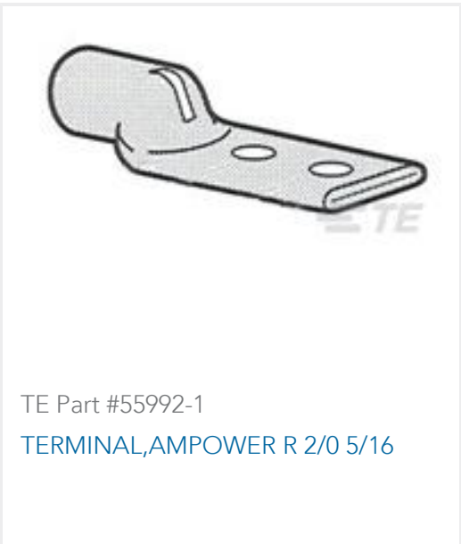
TE Part #55992-1 TERMINAL,AMPOWER R 2/0 5/16