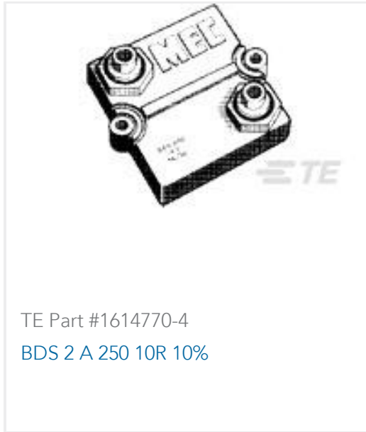
TE Part #1614770-4 BDS 2 A 250 10R 10%