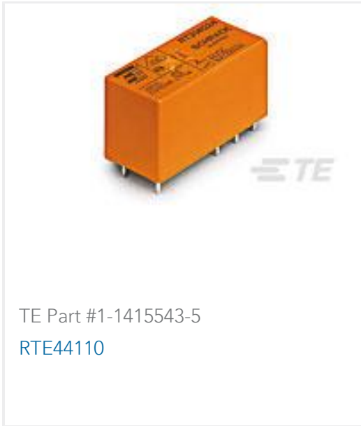
TE Part #1-1415543-5 RTE44110