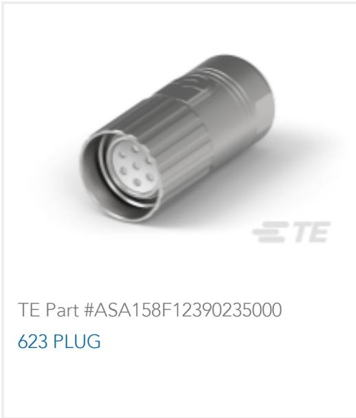
TE Part #ASA158F12390235000 623 PLUG