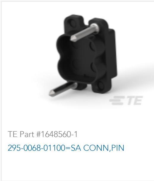
TE Part #1648560-1 295-0068-01100=SA CONN,PIN