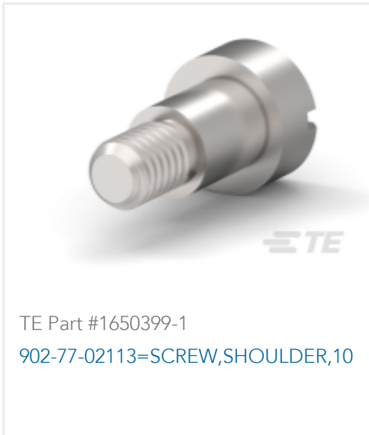
TE Part #1650399-1 902-77-02113=SCREW,SHOULDER,10