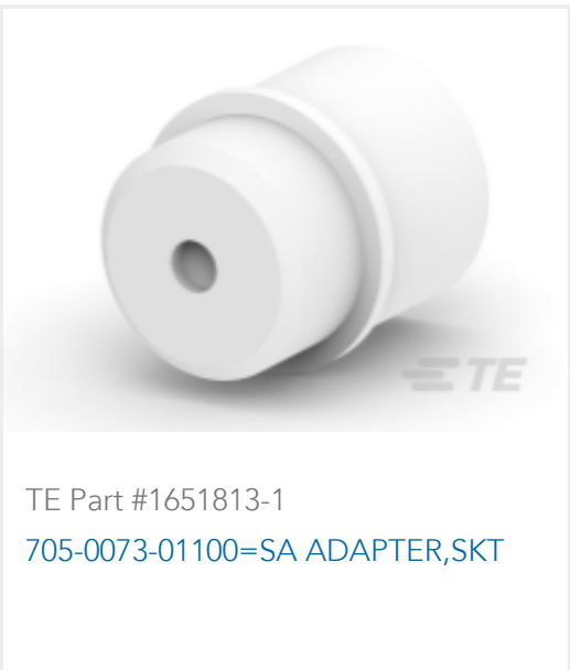
TE Part #1651813-1 705-0073-01100=SA ADAPTER,SKT