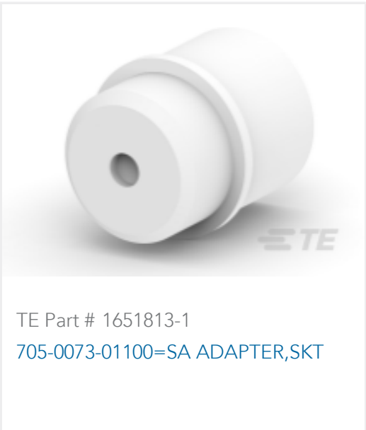
TE Part # 1651813-1 705-0073-01100=SA ADAPTER,SKT