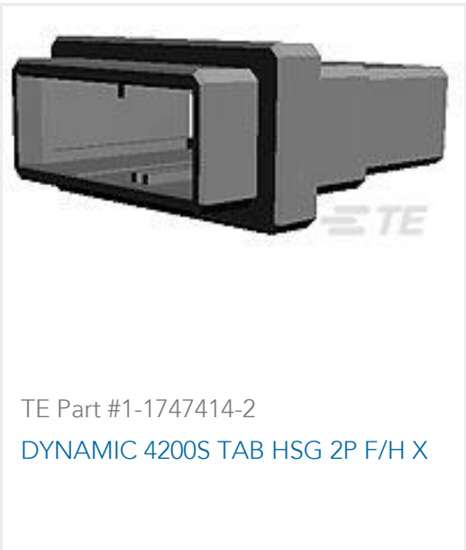
TE Part #1-1747414-2 DYNAMIC 4200S TAB HSG 2P F/H X