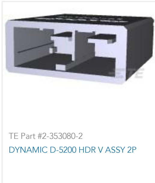
TE Part #2-353080-2 DYNAMIC D-5200 HDR V ASSY 2P