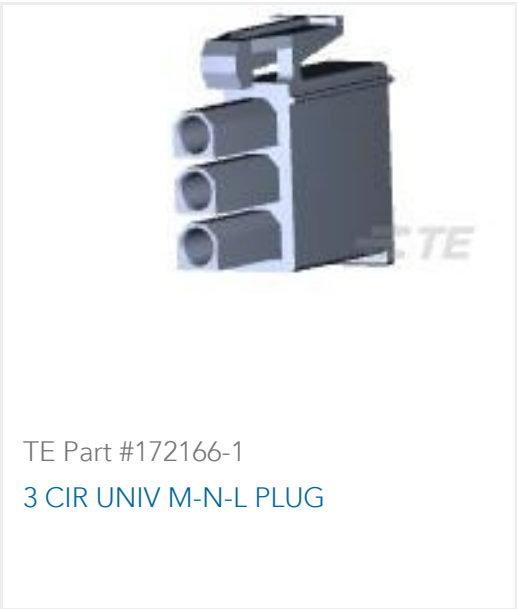
TE Part #172166-1 3 CIR UNIV M-N-L PLUG