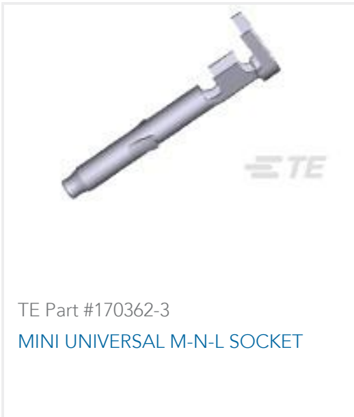
TE Part #170362-3 MINI UNIVERSAL M-N-L SOCKET