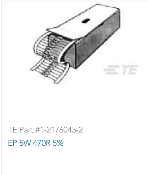
TE Part #1-2176045-2 EP 5W 470R 5%