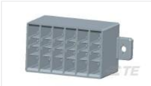
TE Part #1827691-3 DYNATAP 3200 TAP ASSY 24P BOTTOM MOUNT