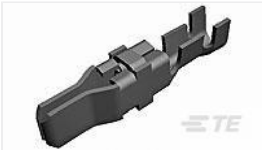
TE Part #66260-2 MALE CONTACT ASSY. (L.P.)