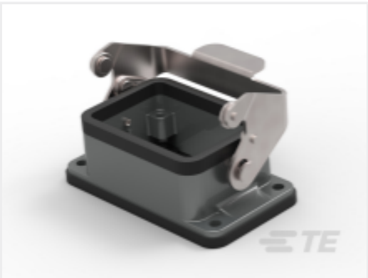
TE Part #T1500062000-000 H6B-AGS