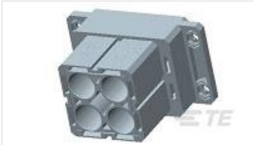
TE Part #2134059-1 DYNAMIC D7300 SOCKET HSG ASSY RVS 4P XX