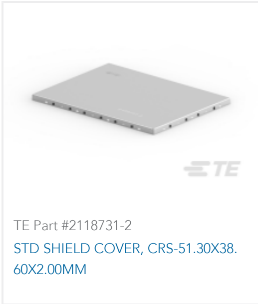
TE Part #2118731-2 STD SHIELD COVER, CRS-51.30X38.60X2.00MM