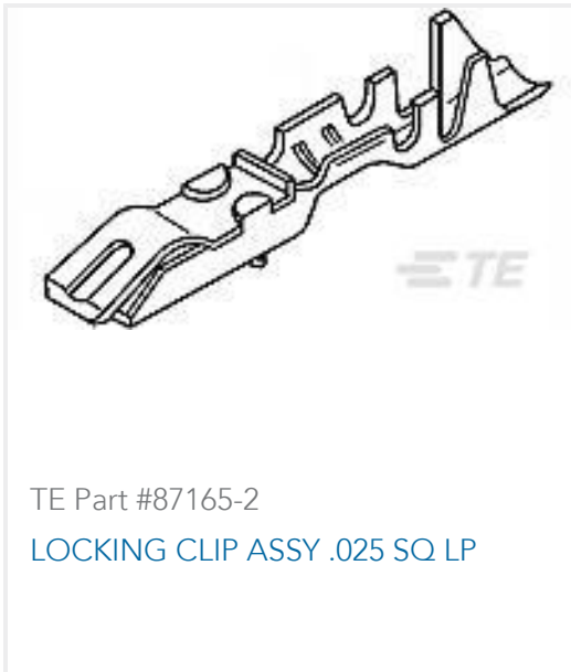
TE Part #87165-2 LOCKING CLIP ASSY .025 SQ LP