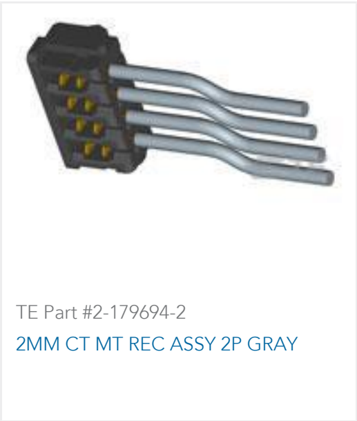
TE Part #2-179694-2 2MM CT MT REC ASSY 2P GRAY