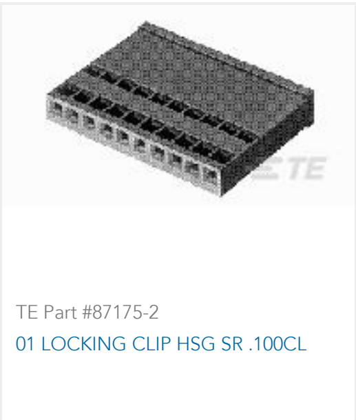
TE Part #87175-2 01 LOCKING CLIP HSG SR .100CL