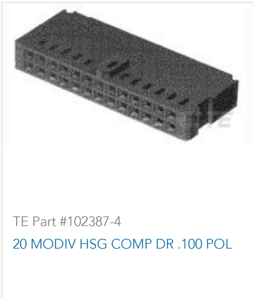
TE Part #102387-4 20 MODIV HSG COMP DR .100 POL