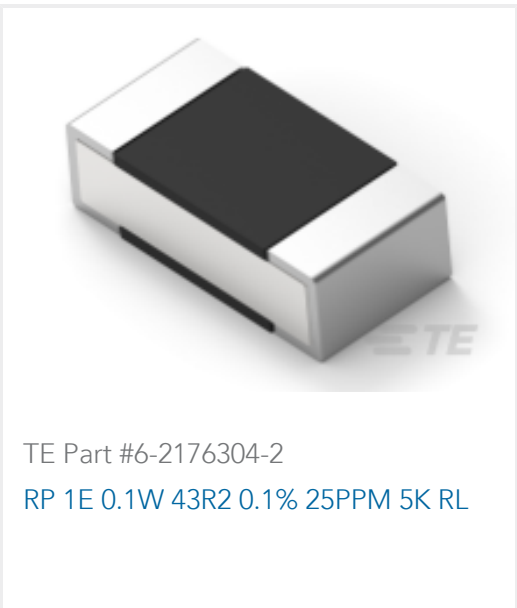
TE Part #6-2176304-2 RP 1E 0.1W 43R2 0.1% 25PPM 5K RL