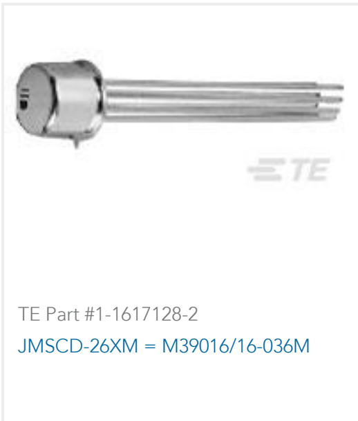
TE Part #1-1617128-2 JMSCD-26XM = M39016/16-036M