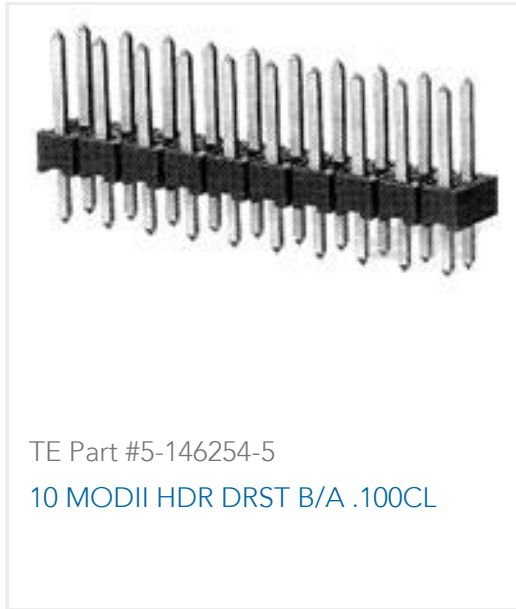
TE Part #5-146254-5 10 MODII HDR DRST B/A .100CL