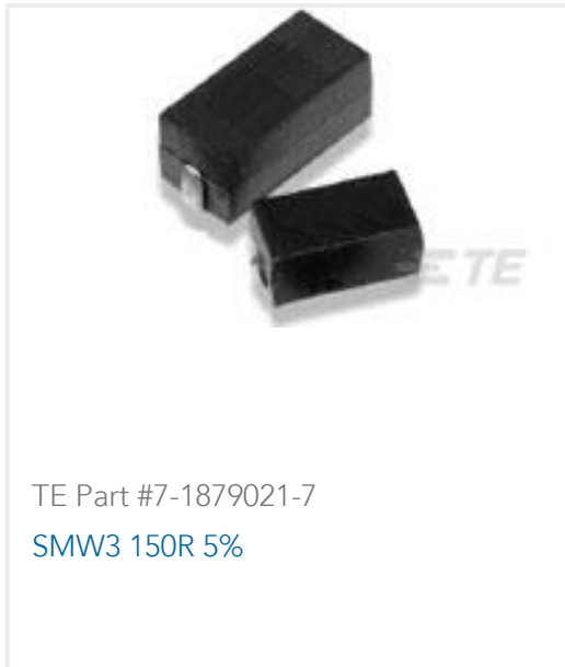
TE Part #7-1879021-7 SMW3 150R 5%