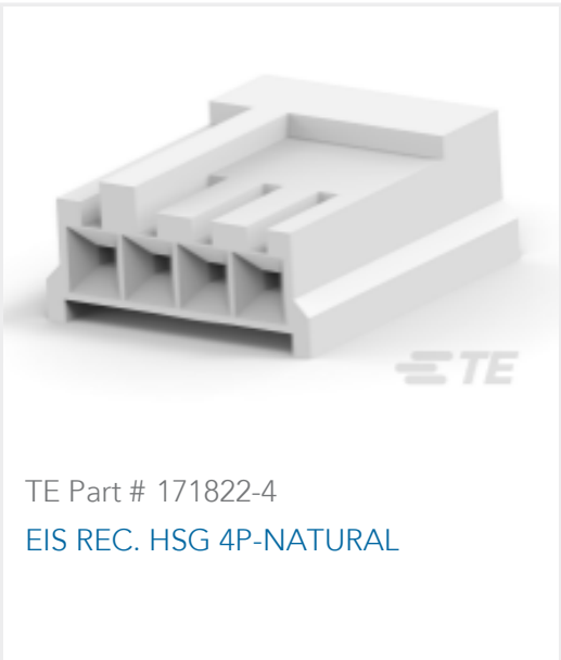
TE Part # 171822-4 EIS REC. HSG 4P-NATURAL