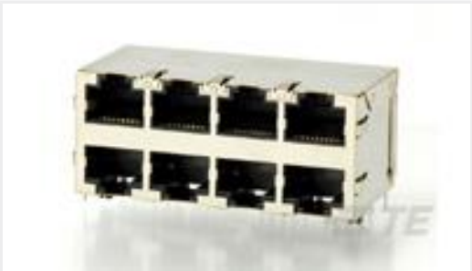
TE Part #5569257-1 STK MJ ASSY,8POS,2X4,SHLD,CAT5