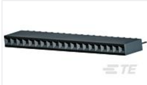
TE Part #6-535541-8 20 MODIV VRT SR CE 100/115