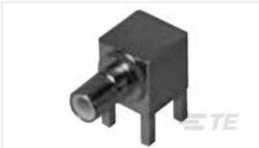
TE Part #415340-1 PCB JACK, RTANG, SMB