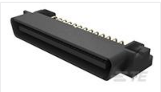
TE Part #1734099-5 Champ 050 series,plug assembly