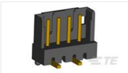
TE Part #292171-3 CT POST HDR ASSY 3P IN-TUBE BL