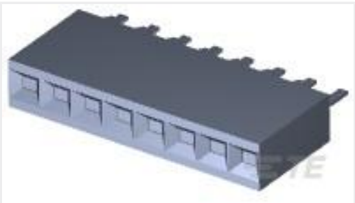
TE Part #5-535541-6 08 MODIV VRT SR CE 100/115