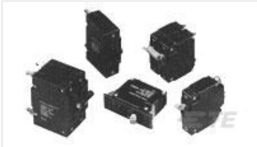
TE Part #8-1393254-1 W92-X112-5=M6/M7/M9/W6/W7