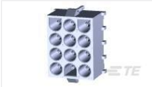
TE Part #641974-3 12P UMNL PIN HDR ASSY 94VO LF