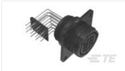
TE Part #1-796404-1 CPC PSTD RCPT,17-16,R/A LF