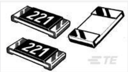
TE Part #4-2176231-5 3522 680R 1% 3W