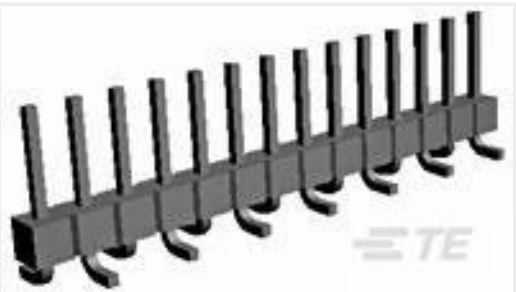
TE Part #1241150-6 6P MOD II BREAK AWAY HDR , SMD, BLISTER