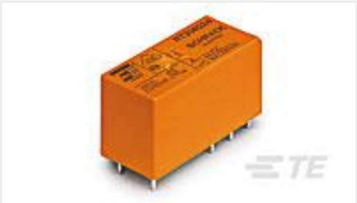
TE Part #7-1393239-8 RT314A05