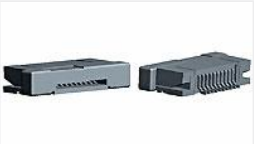
TE Part #1734592-8 FPC CONN. 0.5MM PITCH B/C, 8P