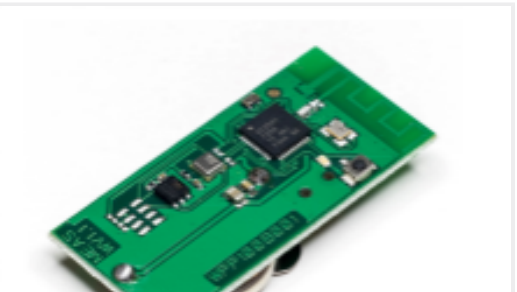
TE Part #WPP100B001 WIRELESS BLE SENSOR TAG V1.1