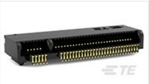
TE Part #2199119-1 M.2 0.5PITCH 3.2H KEY B GOLDFLASH