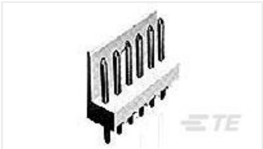
TE Part #173081-2 EIS POST ASSY V 2P GOLD NATU.