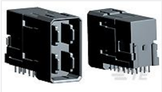
TE Part #2169802-1 IMP,PWR,4PR,R/A,Hdr,6.9,6.9,Tin