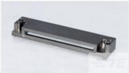
TE Part #2057631-1 CFP Receptacle Cover Assy