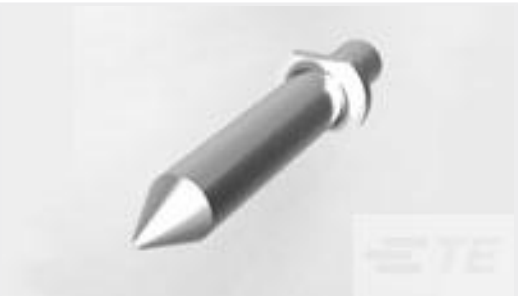
TE Part #223956-1 STV ERMZUB FUEHRUNGSBOLZEN J *M 1 * * *