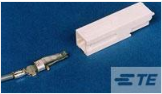
TE Part #556137-4 HSG,AMPINNERGY WTW,1 POS,RED