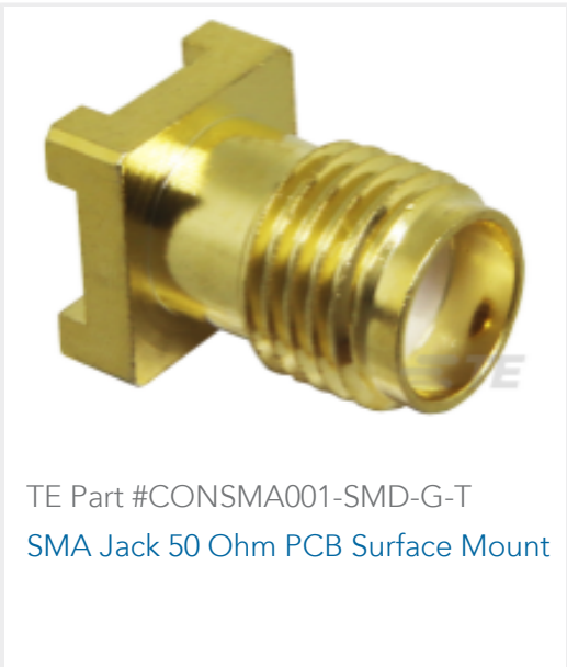
TE Part #CONSMA001-SMD-G-T SMA Jack 50 Ohm PCB Surface Mount