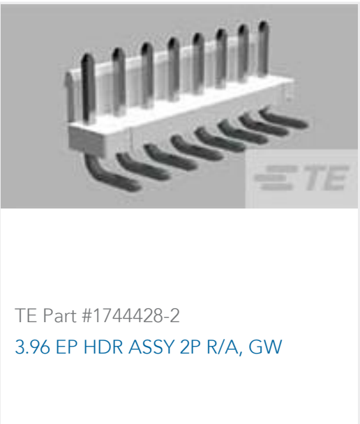
TE Part #1744428-2 3.96 EP HDR ASSY 2P R/A, GW