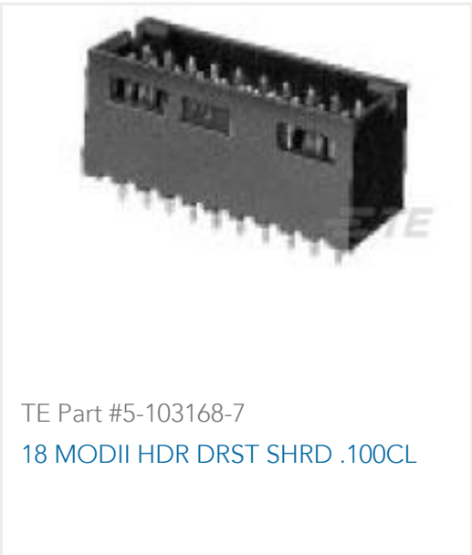
TE Part #5-103168-7 18 MODII HDR DRST SHRD .100CL