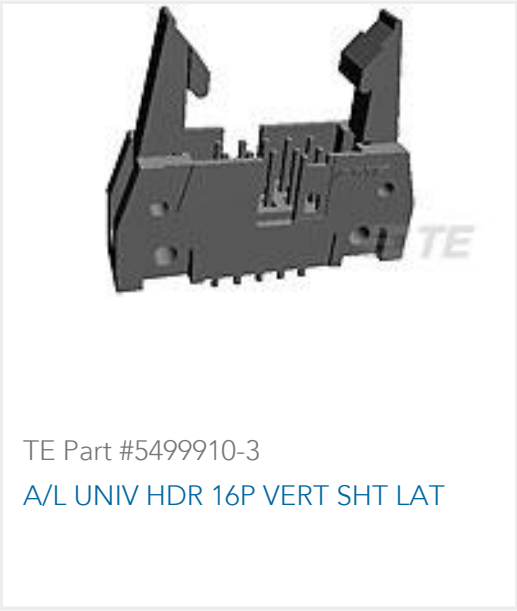
TE Part #5499910-3 A/L UNIV HDR 16P VERT SHT LAT