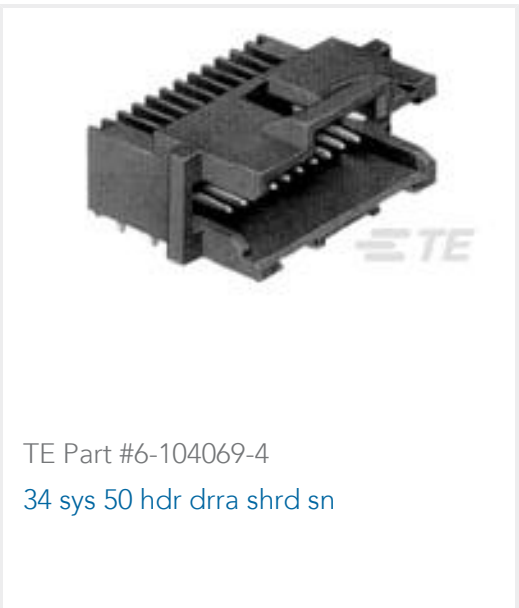
TE Part #6-104069-4 34 sys 50 hdr drra shrd sn