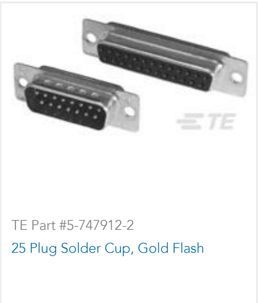
TE Part #5-747912-2 25 Plug Solder Cup, Gold Flash