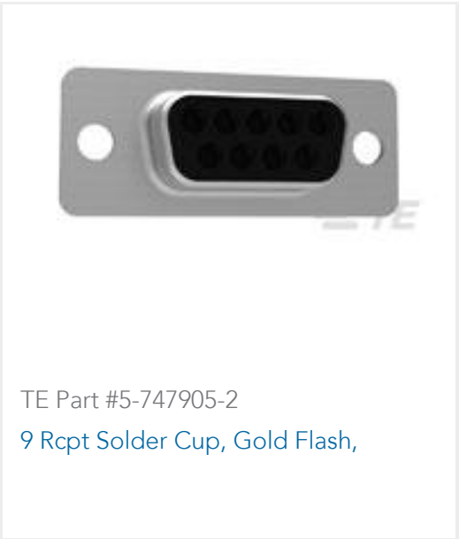
TE Part #5-747905-2 9 Rcpt Solder Cup, Gold Flash,