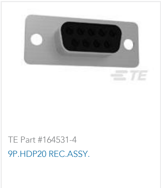
TE Part #164531-4 9P.HDP20 REC.ASSY.