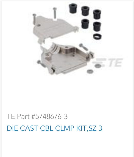
TE Part #5748676-3 DIE CAST CBL CLMP KIT,SZ 3