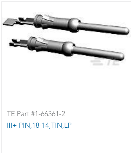
TE Part #1-66361-2 III+ PIN,18-14,TIN,LP