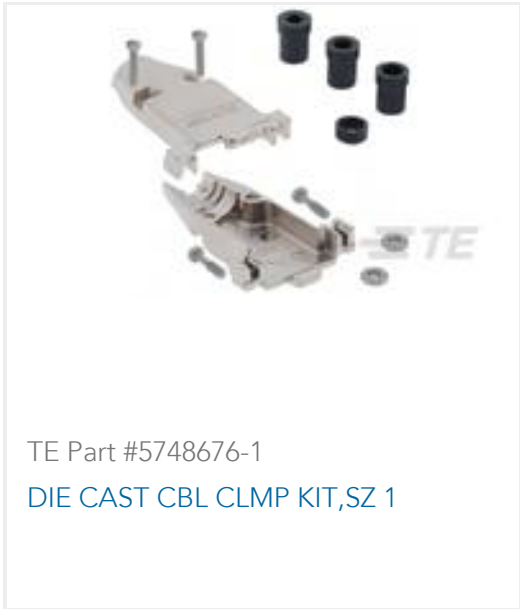
TE Part #5748676-1 DIE CAST CBL CLMP KIT,SZ 1