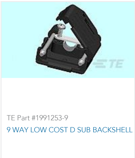
TE Part #1991253-9 9 WAY LOW COST D SUB BACKSHELL