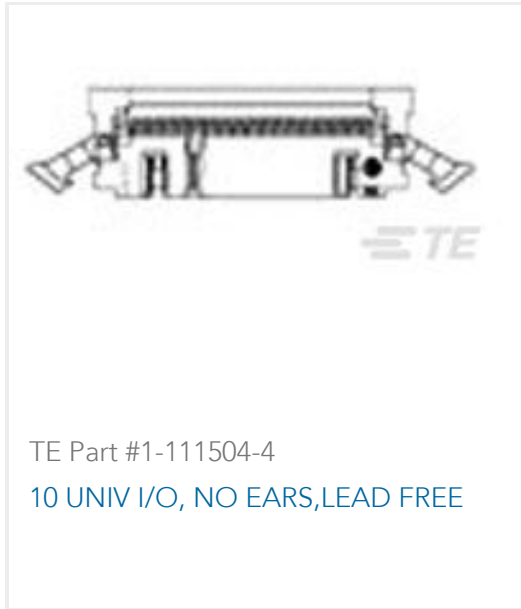
TE Part #1-111504-4 10 UNIV I/O, NO EARS,LEAD FREE