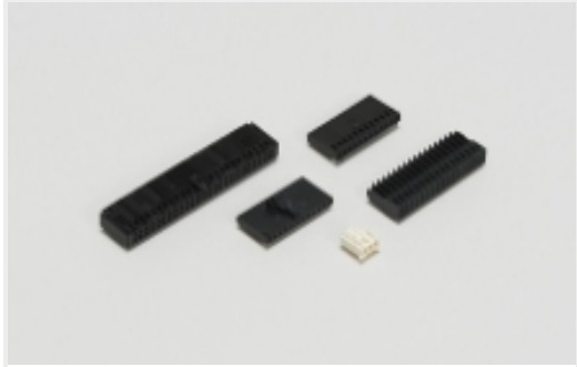
Wire-to-Board Connector Assemblies & Housings(32)