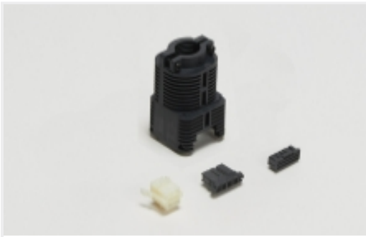
Rectangular Connector Housings(133)