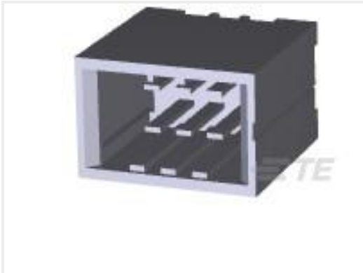
TE Part #178323-5 DYNAMIC D3100D HDR V 6P ASSY SN