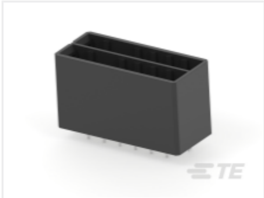
TE Part #CAT-D9934-A75F Header Assembly: Wire-to-Board, 15A, gold or tin plated