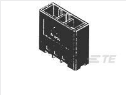
TE Part #2-1747277-4 DYNAMIC D4200 V-HDR ASSY 4P/Y