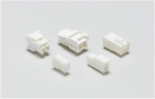
Rectangular Power Connectors(411)