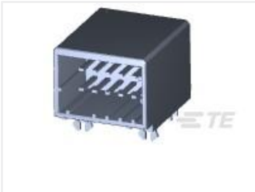
TE Part #1376020-1 DYNAMIC D2100 HDR H ASSY 12P X