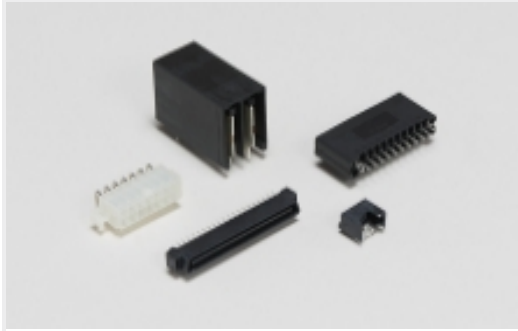
Standard Rectangular Connectors(135)