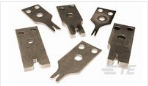
TE Part #3-456403-8 CRIMPER, WIRE .062F