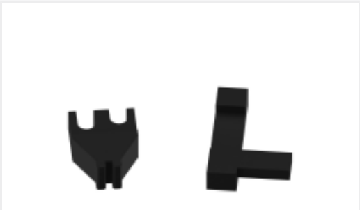
TE Part #1-1752354-9 STANDOFF,HOLD-DOWN