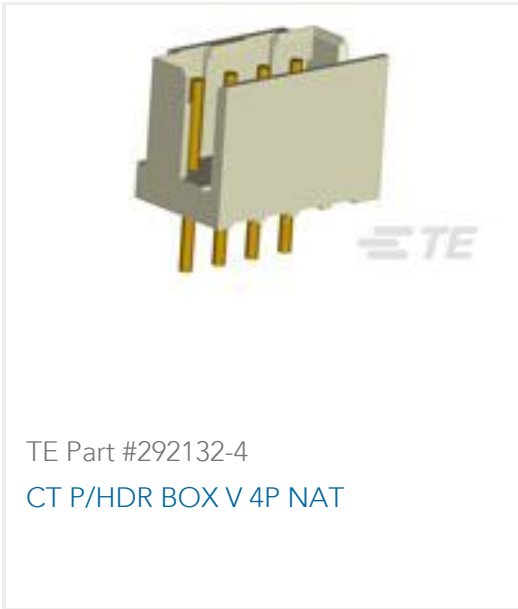
TE Part #292132-4 CT P/HDR BOX V 4P NAT