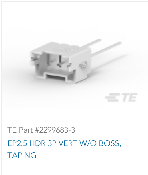
TE Part #2299683-3 EP2.5 HDR 3P VERT W/O BOSS, TAPING