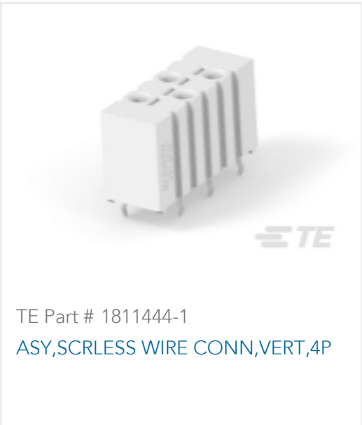
TE Part # 1811444-1 ASY,SCRLESS WIRE CONN,VERT,4P