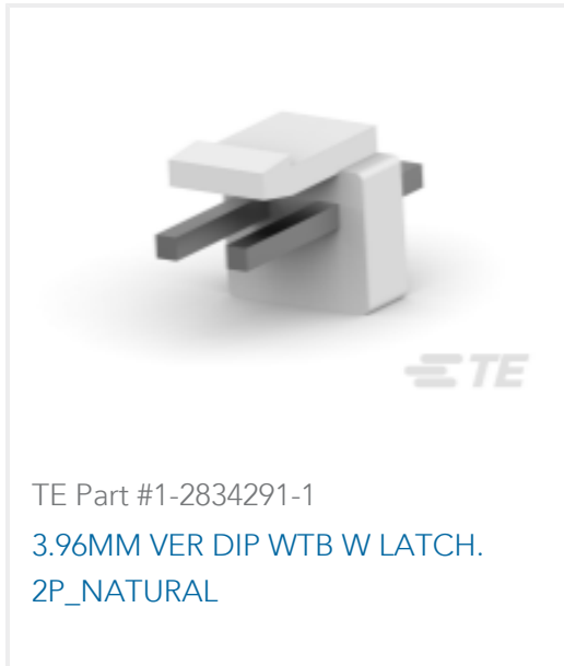
TE Part #1-2834291-1 3.96MM VER DIP WTB W LATCH. 2P_NATURAL