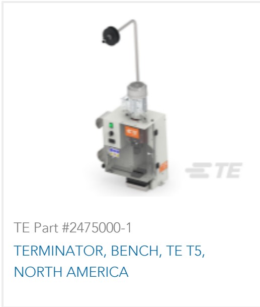
TE Part #2475000-1 TERMINATOR, BENCH, TE T5, NORTH AMERICA