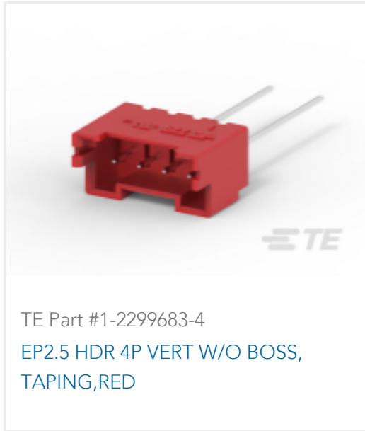
TE Part #1-2299683-4 EP2.5 HDR 4P VERT W/O BOSS, TAPING,RED