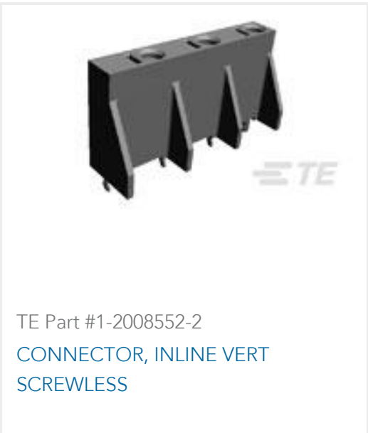
TE Part #1-2008552-2 CONNECTOR, INLINE VERT SCREWLESS