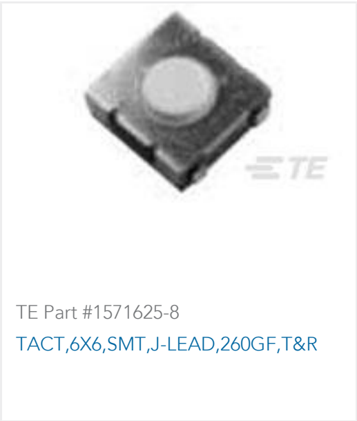
TE Part #1571625-8 TACT,6X6,SMT,J-LEAD,260GF,T&R