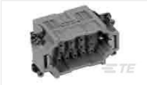
TE Part #1102918-1 HEE.10.STI.C.B1-10