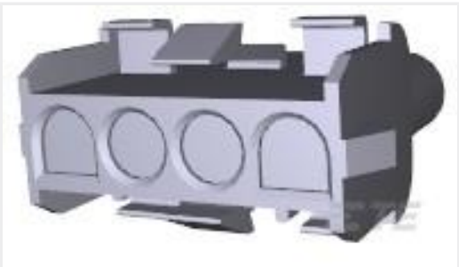
TE Part #1-480703-9 04P UMNL CAP HSG BLK