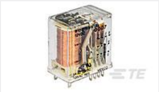
TE Part #8-1393766-1 R10-E1Z4-V700=R10