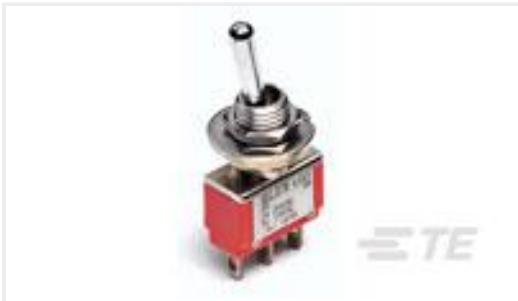
TE Part #4-1825137-2 A105TZQ04