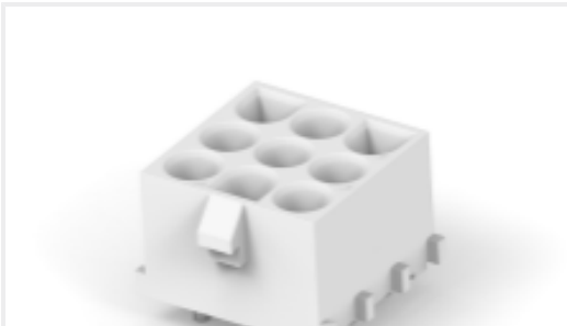
TE Part #5-2029002-0 09P UMNL HDR ASSY PC, NDH