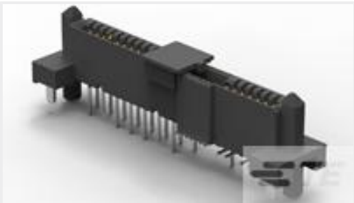
TE Part #1735104-3 SAS BACKPLANE RECEPT, VERTICAL