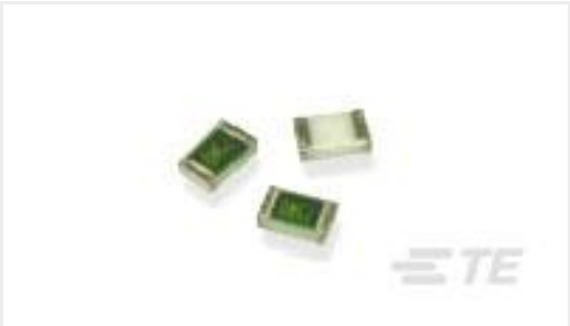
TE Part #7-1879126-7 RN 0402 205R 0.1% 10PPM 1K RL