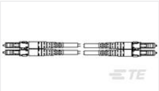
TE Part #1828936-2 CA FO 2FIB B/O SM,LC ODVA