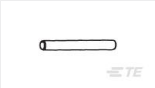
TE Part #1445886-1 RET PIN,75/120/180A,SP,1 HIGH