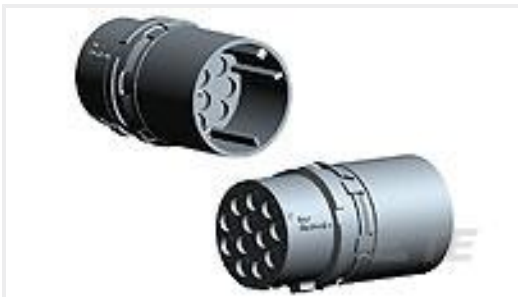
TE Part #1103431-1 MALE INSERT,CRIMP,12-POS.TYPE III+