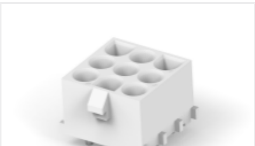
TE Part #5-2029002-1 09P UMNL HDR ASSY PC, NDH