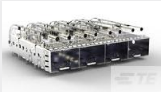
TE Part #2198234-2 SFP+ Enhanced 1x4, SAN Heatsink, LP