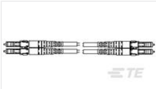
TE Part #2064915-3 C/A,F/O,2F I/O MM50 OM3,SCLC DPX