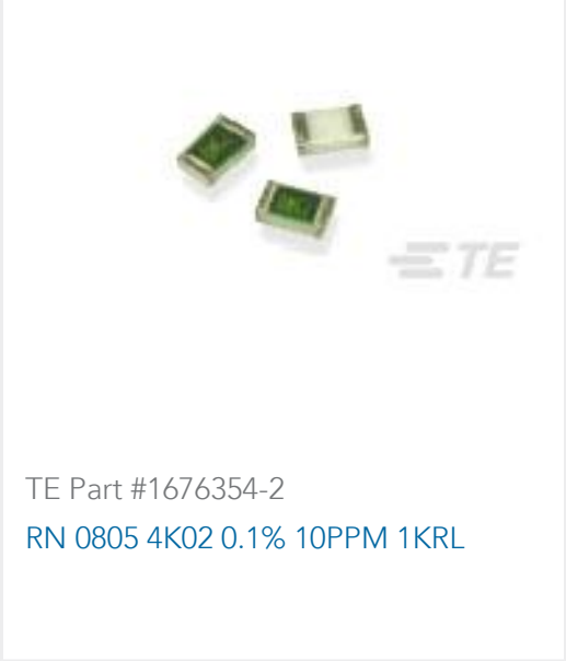
TE Part #1676354-2 RN 0805 4K02 0.1% 10PPM 1KRL