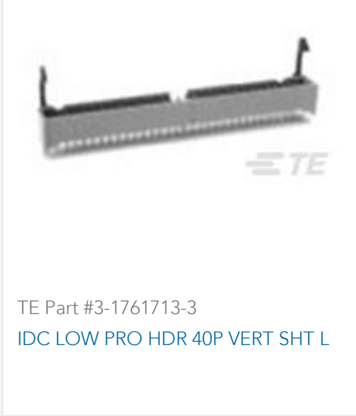
TE Part #3-1761713-3 IDC LOW PRO HDR 40P VERT SHT L