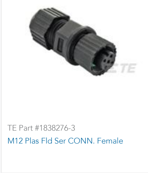
TE Part #1838276-3 M12 Plas Fld Ser CONN. Female