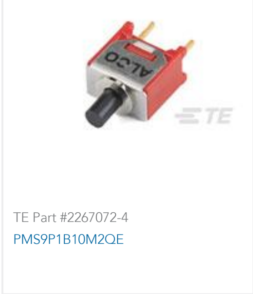
TE Part #2267072-4 PMS9P1B10M2QE