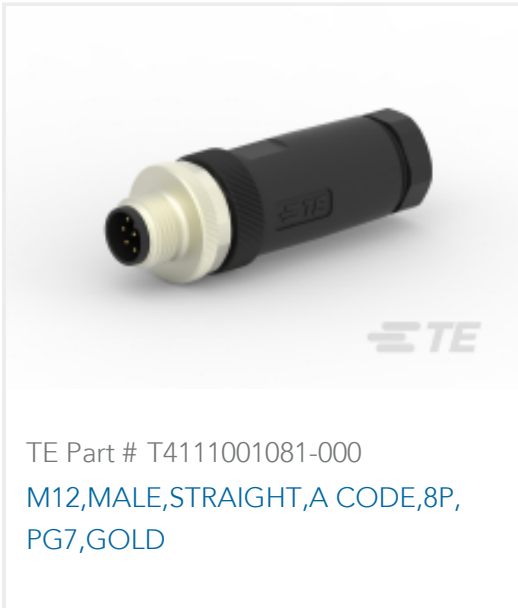
TE Part # T4111001081-000 M12,MALE,STRAIGHT,A CODE,8P,PG7,GOLD