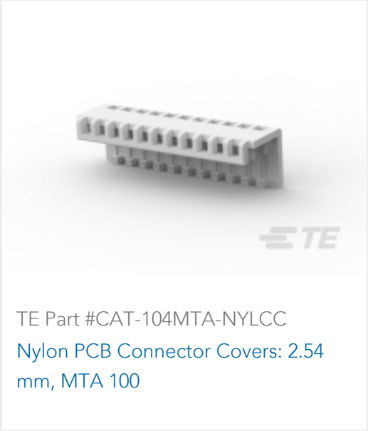
TE Part #CAT-104MTA-NYLCC Nylon PCB Connector Covers: 2.54 mm, MTA 100