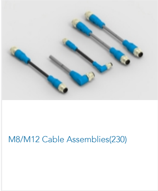
M8/M12 Cable Assemblies(230)