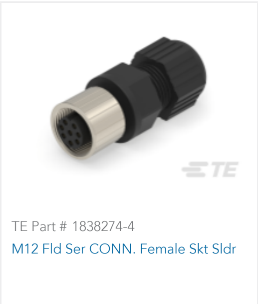
TE Part # 1838274-4 M12 Fld Ser CONN. Female Skt Sldr