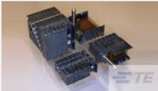
TE Part #2057419-2 IMP100S,H,V2P10C,LG,OEW39,4.9