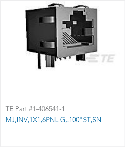
TE Part #1-406541-1 MJ,INV,1X1,6PNL G.,100"ST,SN