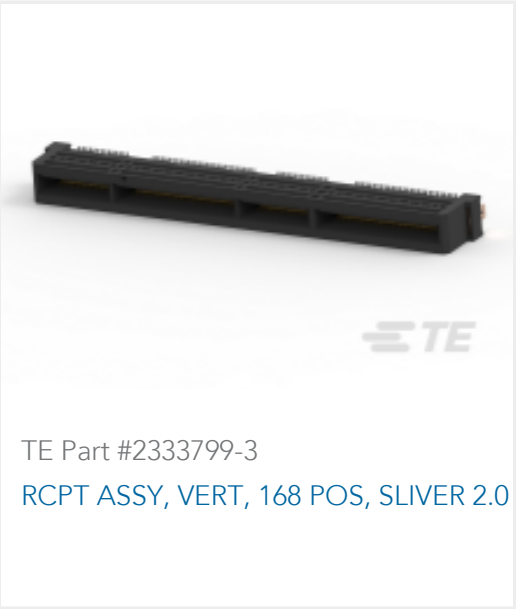
TE Part #2333799-3 RCPT ASSY, VERT, 168 POS, SLIVER 2.0