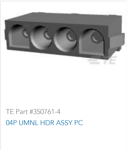
TE Part #350761-4 04P UMNL HDR ASSY PC