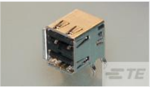
TE Part #5787745-3 USB A R/A STAK ASSY THRU HOLE