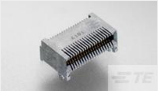
TE Part #2110819-1 QSFP+ Enh EVERCLEAR PT Conn