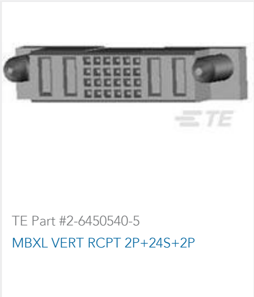
TE Part #2-6450540-5 MBXL VERT RCPT 2P+24S+2P