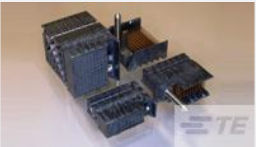
TE Part #2057417-1 IMP100S,R,RA4P8C,UG,39