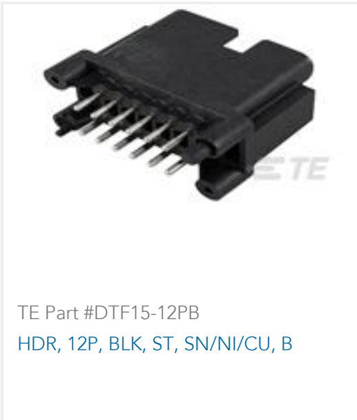
TE Part #DTF15-12PB HDR, 12P, BLK, ST, SN/NI/CU, B