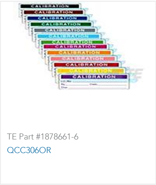
TE Part #1878661-6 QCC306OR