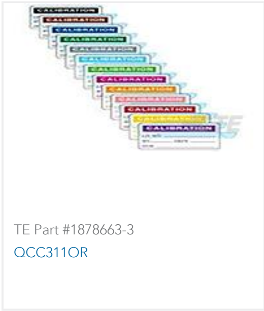
TE Part #1878663-3 QCC311OR