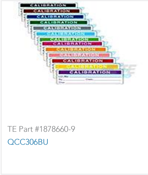
TE Part #1878660-9 QCC306BU