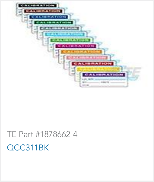
TE Part #1878662-4 QCC311BK