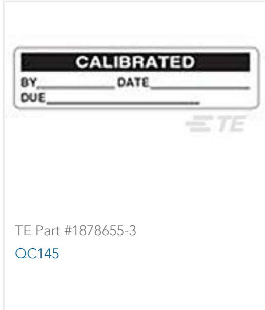
TE Part #1878655-3 QC145