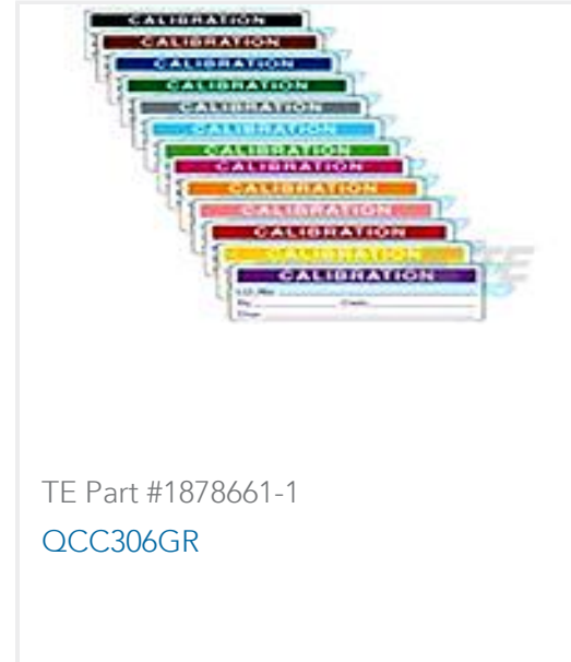
TE Part #1878661-1 QCC306GR