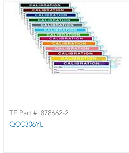
TE Part #1878662-2 QCC306YL