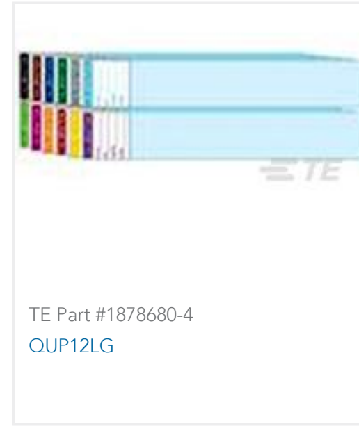
TE Part #1878680-4 QUP12LG