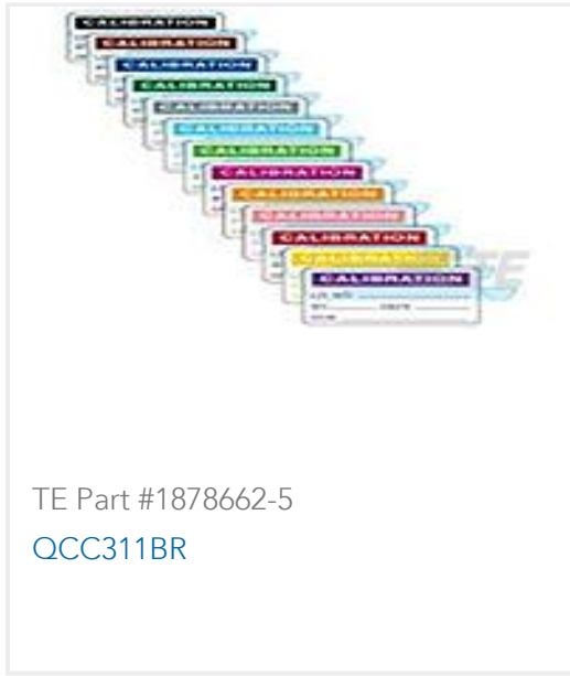
TE Part #1878662-5 QCC311BR