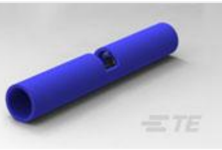
TE Part #327583 SPLICE BUTT PIDG 16-14/22-18