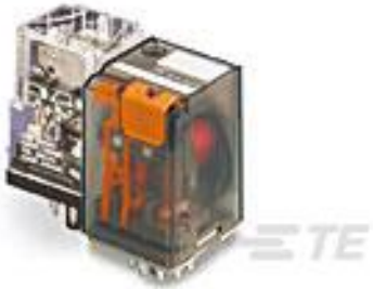
TE Part #4-1393104-7 KRPA-11DG-6=KRPA