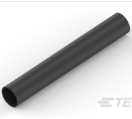
TE Part #NB11382001 ATUM-52/13-0-STK