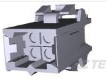
TE Part #207016-1 4 POS SQ GRID METRIMATE RCPT