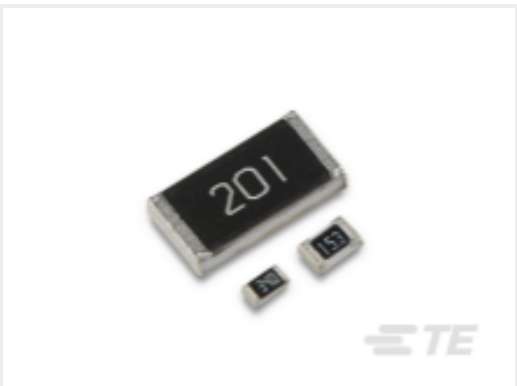
TE Part #1-2176329-0 CRGP 1210 56R 1%