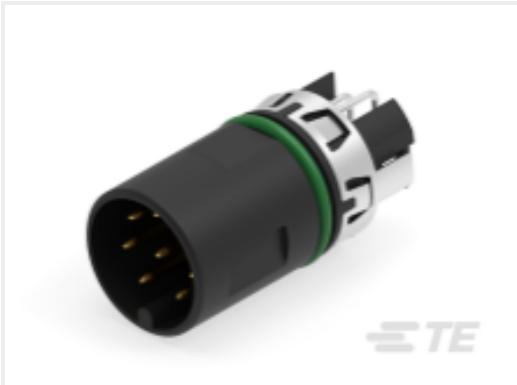
TE Part #235045-E M12 MALE, A CODE,RA, 8P THR REAR MOUNT