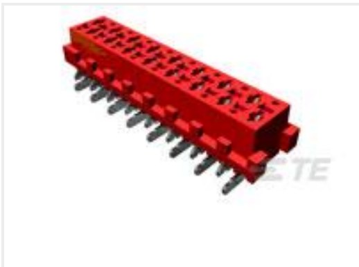
TE Part #188275-4 MICRO-MATCH SMD FTE