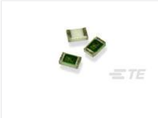
TE Part #2176217-3 CPF A 0805 13R3 0.1% 25PPM 1K RL