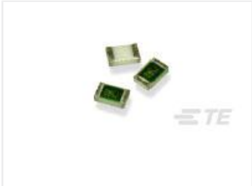
TE Part #4-1614891-2 CPF 0805 191R 0.1% 25PPM 1K RL