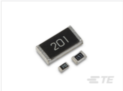
TE Part #2176327-9 CRGP 0805 47R 1%