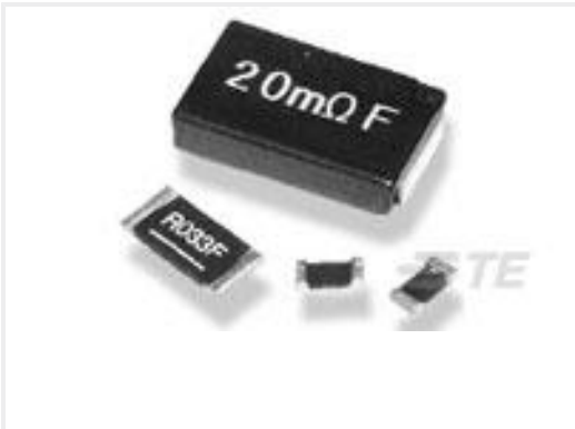
TE Part #3-1879378-6 TLR 2512 1.0W R007 1% 75PPM 2K RL