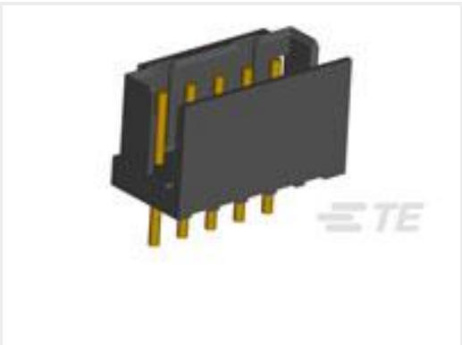
TE Part #292133-7 CT P/HDR ASSY BOX V 7P W/O KIN