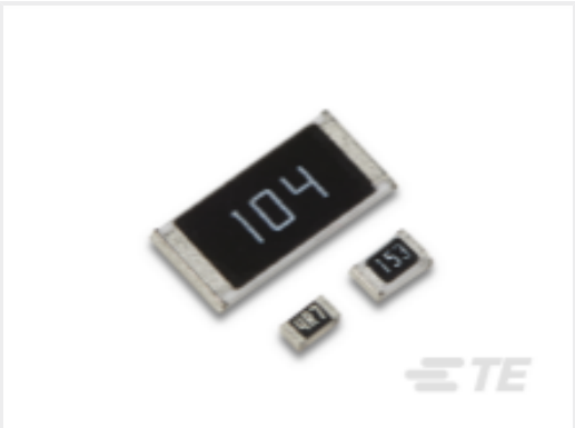
TE Part #6-2176347-1 CRGCQ 2010 1M0 1%