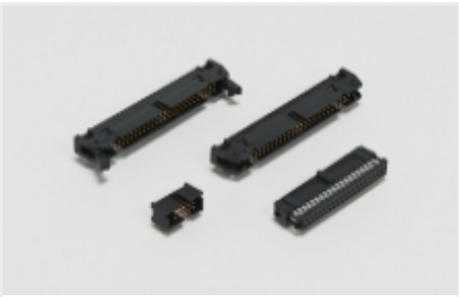
Ribbon Cable Connectors(183)