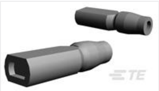
TE Part #2-180930-0 250 FASTON HSG., REC., 1 POS, NATURAL