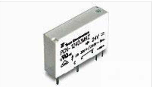
TE Part #7-1461491-6 PCN-124D3MHZ, 001B