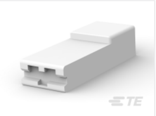
TE Part #926539-1 250 FASTON HSG. REC. 1P NATURAL