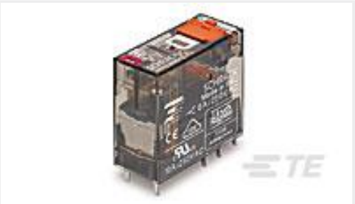
TE Part #1887202-1 XT424LC4