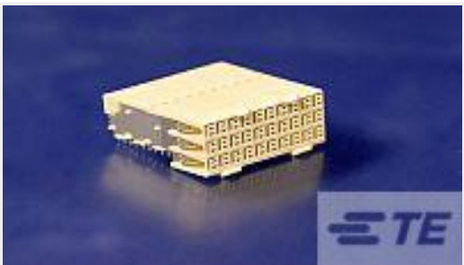
TE Part #6469081-1 HMZD 3PR, RECEPTACLE ASSEMBLY