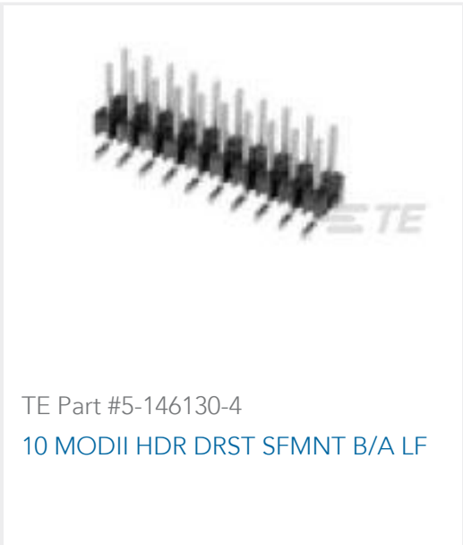
TE Part #5-146130-4 10 MODII HDR DRST SFMNT B/A LF