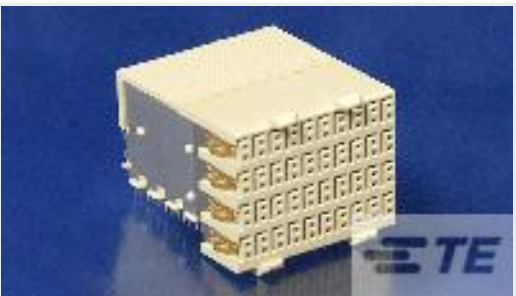
TE Part #2065657-1 zd Plus, 4 pair, receptacle assy