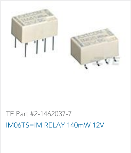
TE Part #2-1462037-7 IM06TS=IM RELAY 140mW 12V