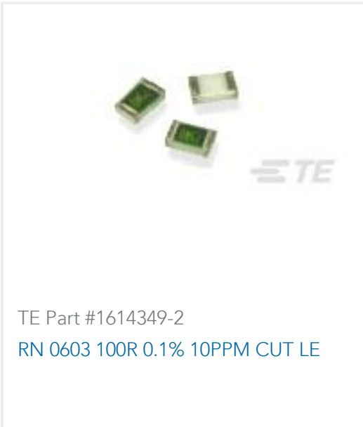
TE Part #1614349-2 RN 0603 100R 0.1% 10PPM CUT LE