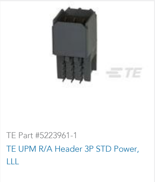
TE Part #5223961-1 TE UPM R/A Header 3P STD Power, LLL