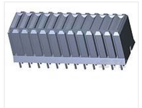
TE Part #120953-4 UPM EXPANDED RCPT ASSEMBLY