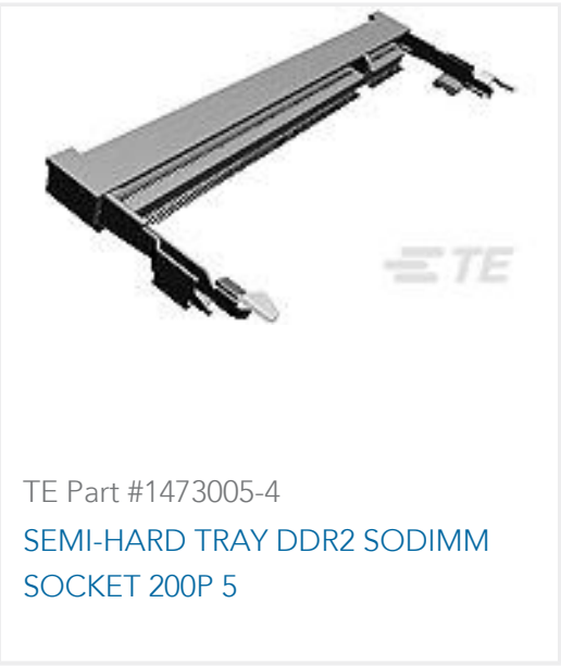
TE Part #1473005-4 SEMI-HARD TRAY DDR2 SODIMM SOCKET 200P 5