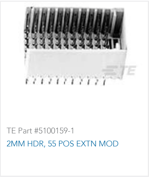
TE Part #5100159-1 2MM HDR, 55 POS EXTN MOD