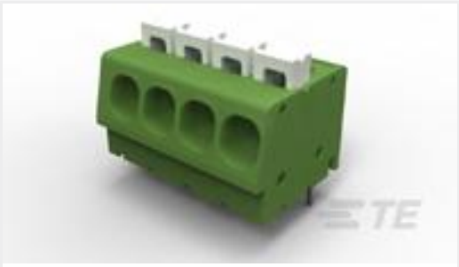
TE Part #1986711-2 SCREWLESS, SW,2P,5.0 PCB