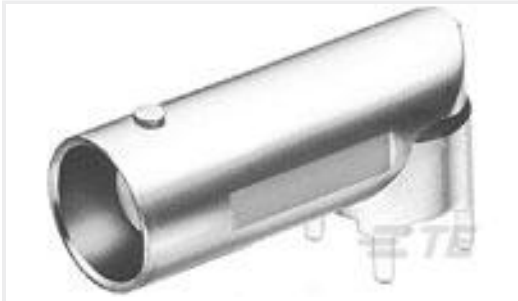
TE Part #413631-1 JACK,RTANG, PCB,50 OHM, BNC