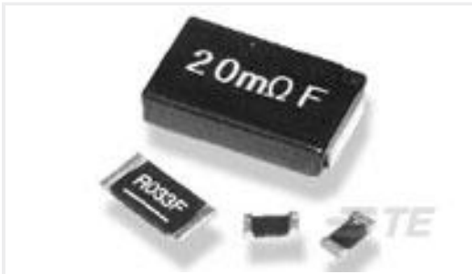
TE Part #3-1879378-3 TLR 2512 1.0W R004 1% 100PPM 2K RL