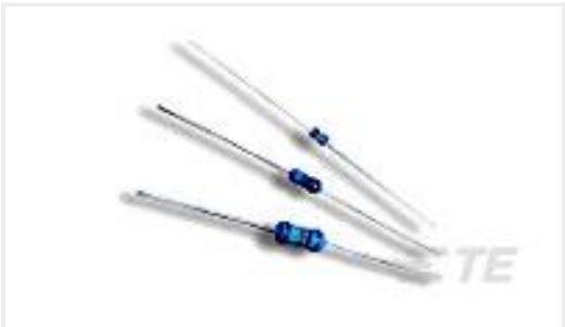
TE Part #6-1622796-2 YR1 0.1% 150R