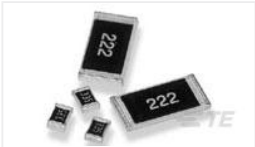
TE Part #1622866-1 CRG0603 1% 1K0