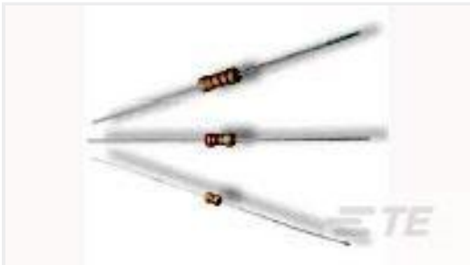
TE Part #7-1623933-6 CFR50 5% 8R2