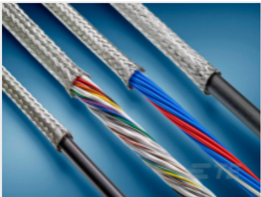
TE Part #CD00203001 RAY-90-5.0(100)CK1100