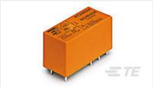
TE Part #4-1415538-1 RT334730WG