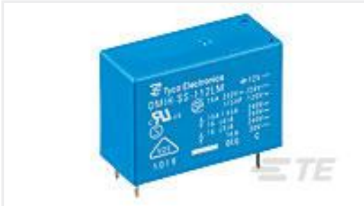
TE Part #9-1440000-6 OMIT-SH-112LM,394