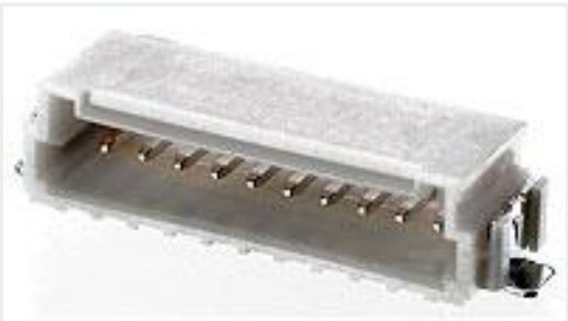
TE Part #2-292227-0 1.5 MINI CT SGL H SMT W BOSS 2