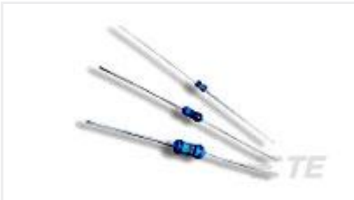
TE Part #1622317-1 LR1 1% 13R