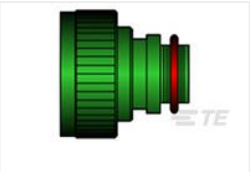
TE Part #CF4657-000 TXR41SJ00-1610AI