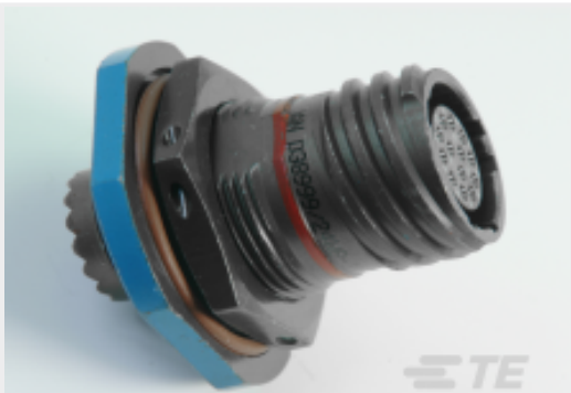
TE Part #YDTS24F11-35SCV001 RECP ASSY