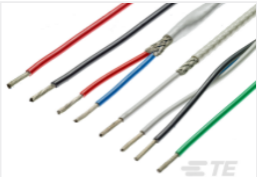
TE Part #395605-000 44A0141-20-MST4CS2275