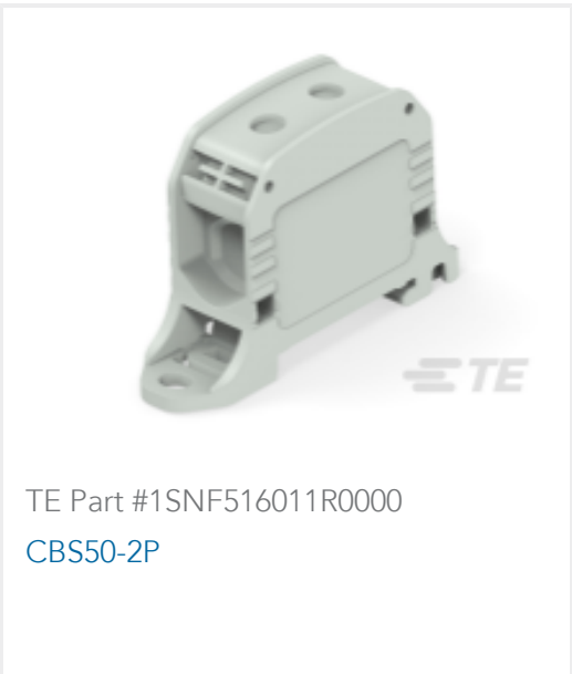
TE Part #1SNF516011R0000 CBS50-2P