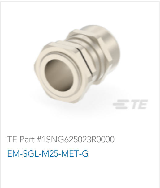
TE Part #1SNG625023R0000 EM-SGL-M25-MET-G