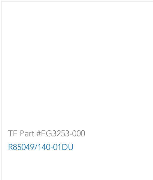
TE Part #EG3253-000 R85049/140-01DU