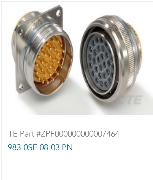
TE Part #ZPF000000000007464 983-0SE 08-03 PN