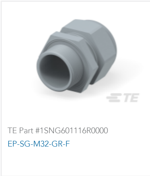
TE Part #1SNG601116R0000 EP-SG-M32-GR-F