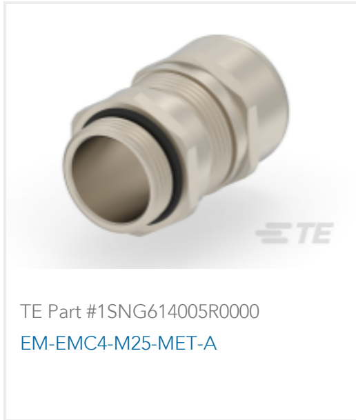
TE Part #1SNG614005R0000 EM-EMC4-M25-MET-A