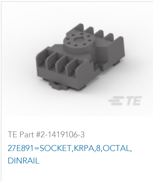
TE Part #2-1419106-3 27E891=SOCKET,KRPA,8,OCTAL, DINRAIL