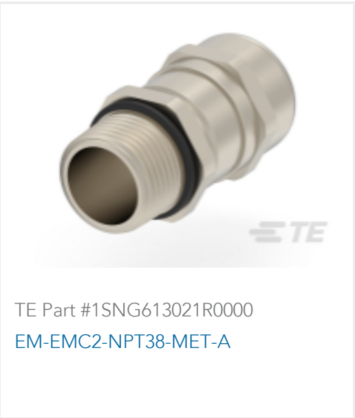
TE Part #1SNG613021R0000 EM-EMC2-NPT38-MET-A