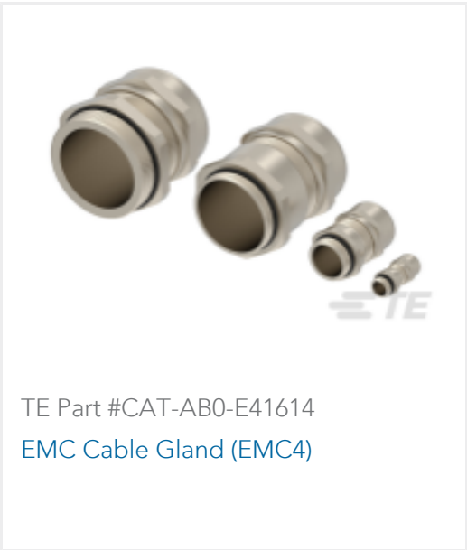
TE Part #CAT-AB0-E41614 EMC Cable Gland (EMC4)