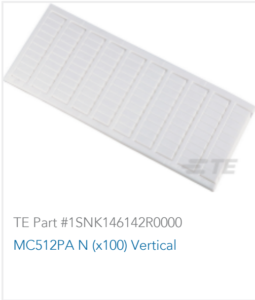
TE Part #1SNK146142R0000 MC512PA N (x100) Vertical