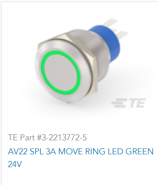
TE Part #3-2213772-5 AV22 SPL 3A MOVE RING LED GREEN 24V