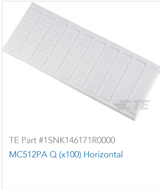
TE Part #1SNK146171R0000 MC512PA Q (x100) Horizontal