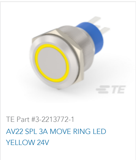
TE Part #3-2213772-1 AV22 SPL 3A MOVE RING LED YELLOW 24V