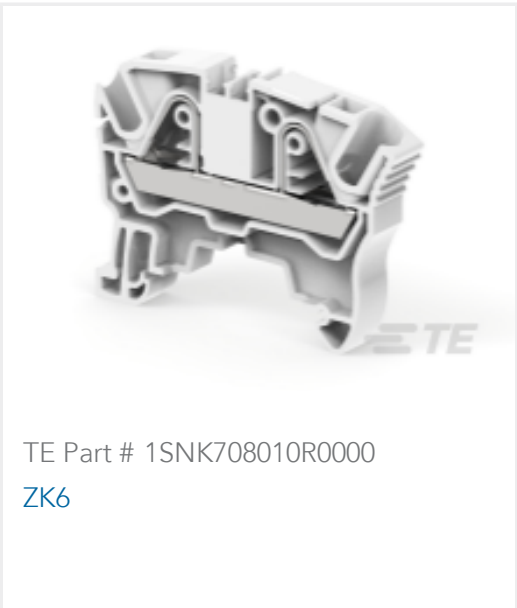
TE Part # 1SNK708010R0000 ZK6