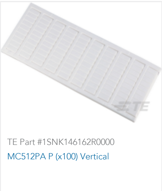
TE Part #1SNK146162R0000 MC512PA P (x100) Vertical