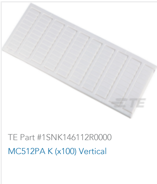
TE Part #1SNK146112R0000 MC512PA K (x100) Vertical