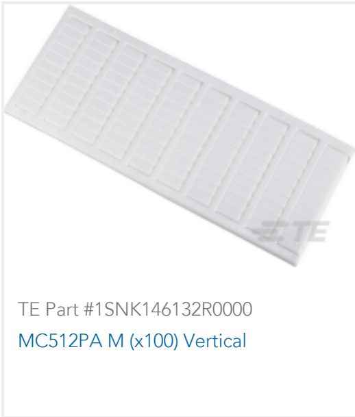
TE Part #1SNK146132R0000 MC512PA M (x100) Vertical