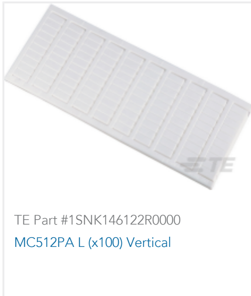
TE Part #1SNK146122R0000 MC512PA L (x100) Vertical