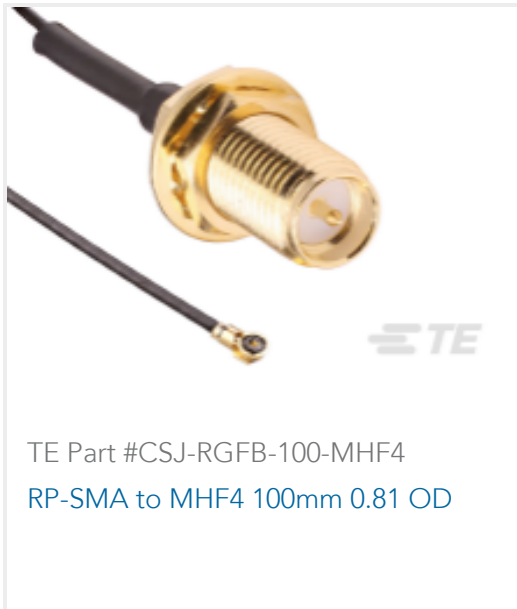
TE Part #CSJ-RGFB-100-MHF4 RP-SMA to MHF4 100mm 0.81 OD